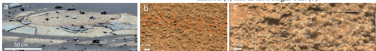
Fig. 3. a) Concentric feature at Amundsen (Mastcam-Z). b) Carbonate-rich coarse-grain soil target Toothawara (RMI). c) Rough texture of Baresand Point target at Turquoise Bay (RMI). Inset shows darker grains similar in size to the soil grains, apparently weathering out of bedrock.