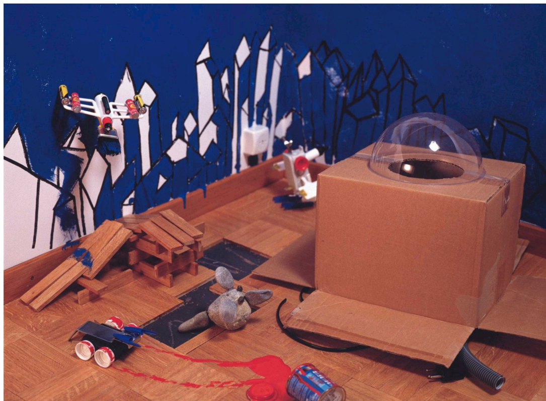
Ill. 4 Vincent Kohler. Bricopolis . Genève : Quiquandquoi éditions, Art y es-tu ?, 2003, onzième double page (album non paginé).

The artists thus might consider the collection's dedication to fabricating these books over a long period something of an awakening, made possible via the museum and collection director's permanent revitalization of the works. It is from this perspective that we believe we should understand the exhibition displaying Claude-Hubert Tatot's collection at the Villa Bernasconi in 2002. In the bedrooms and salons of a Genevese villa, these artists were invited to present something "related to" the books they had created. The idea behind the exhibition was not to simply show originals or the artists' sketches and notebooks, but to dare the artists once again to enter unfamiliar terrain, and to see, collectively now, how their artworks might play and replay off of each other. Jean-Luc Verna decided on transferring his work to the wall; Le Gentil Garçon went with the same idea as before (using his "Supergribouillepen," a felt-tip drawing made without lifting a hand), but now applied it to create very different images; John Armleder offered to display works that were not paint drippings, as he had done in the picture book, but rather to make a gesture that would create a link between the collection's artists and the venue, by creating a tapestry for the walls. The exhibition acted as a new invitation to experiment, a new building block to add to the collection. Thus, a book collection sparked by museum exhibitions turned back from the books to the exhibition space once more.