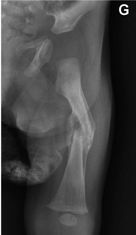
Figure 3: X ray after 2 months