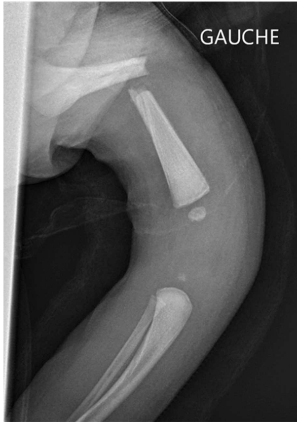
Figure 1: initial post-natal X Ray