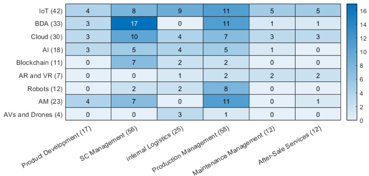
Figure 2. Research focus heatmap

Furthermore, the literature mainly has focused on technologies that can collect data (IoT), store and share it (cloud), and analyze it for decision-making information (BDA). In particular, the application of BDA to analyze market fluctuations and aid decision makers has attracted many scholars (Akpan et al., 2020; Dolgui & Ivanov, 2021b; Ivanov et al., 2021). IoT also has been studied thoroughly with applications for all business processes; however, AVs, drones, AR, and VR are the least-studied technologies, probably because their impact is mostly practical, and their applications are related to a few specific activities, such as material transportation, inventory management, machinery maintenance, and workforce training.