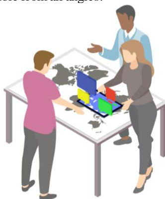
Figure 1. SPART: on-Surface Positioning for Augmented Reality

These issues could be prevented if mobile devices were directly placed on the to-be-augmented surface (map, image, plan etc.). As shown in figure 1, this configuration, very similar to the one of an interactive tabletop, provides a common focal point for group attention and allows all group members to view augmentations while maintaining awareness on other group members' actions and keeping hands free. Furthermore, the mobile device serves as a convenient input method since its horizontal position on the surface allows for stability and is accessible from all angles.