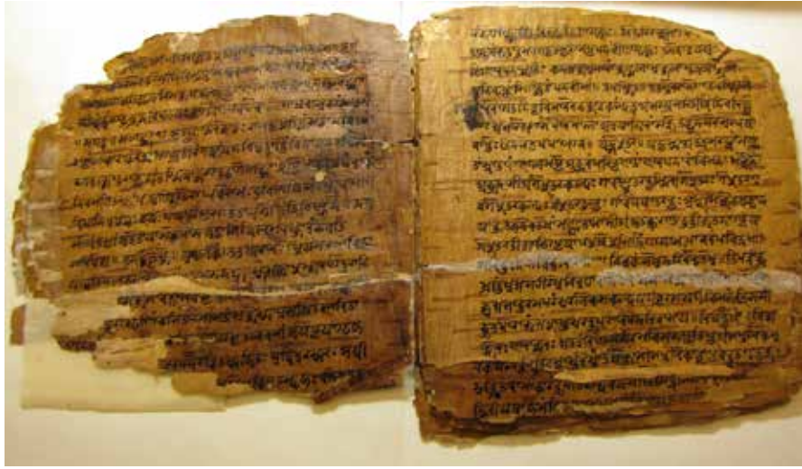
Fig. 1 Folio of Bodleian Library, MS Stein Or d 74 ii, a birch-bark Sanskrit manuscript in Śāradā script from Kashmir transmitting Vallabhadeva's tenth-century Raghupañcikā , the earliest known commentary on Kālidāsa's Raghuvamśa .