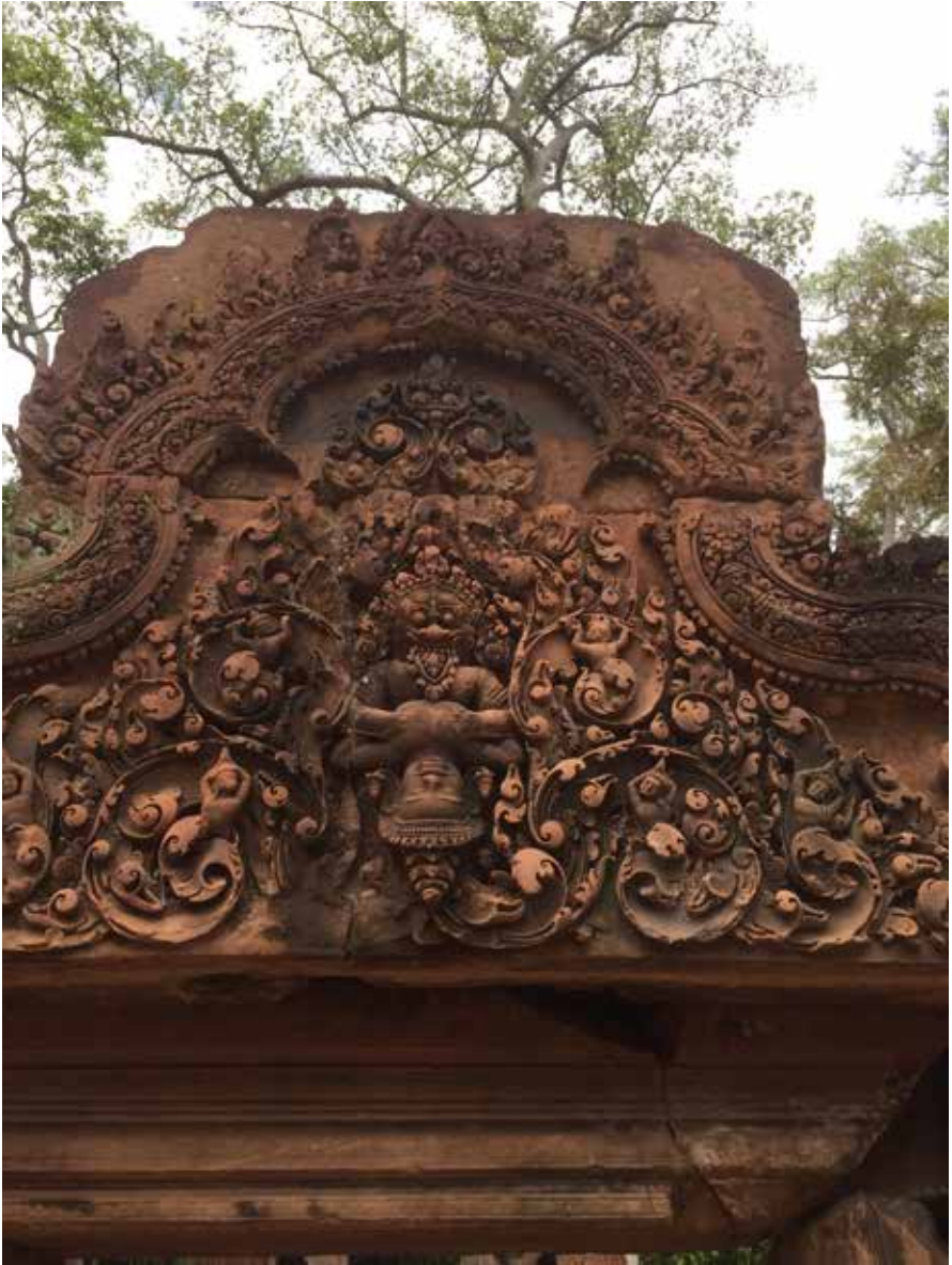
Fig. 7 Detail of one of the many finely carved pediments at Banteay Srei. In the centre is Viṣṇu as Narasiṃha (half man, half lion) disembowelling the demon Hiranyakaśipu.