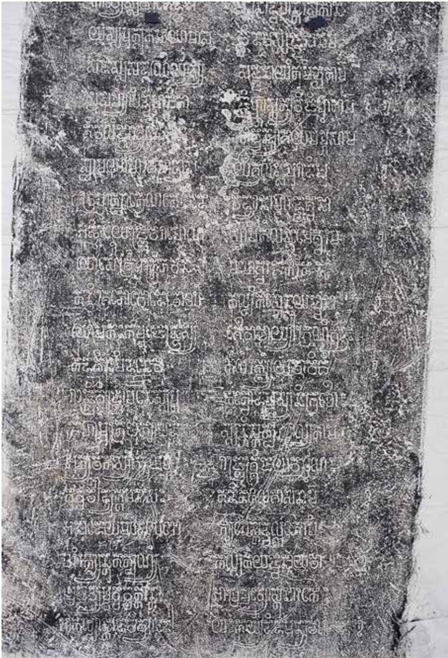
Fig. 2 Image of lower portion of EFEO estampage n. 525 of K. 620.