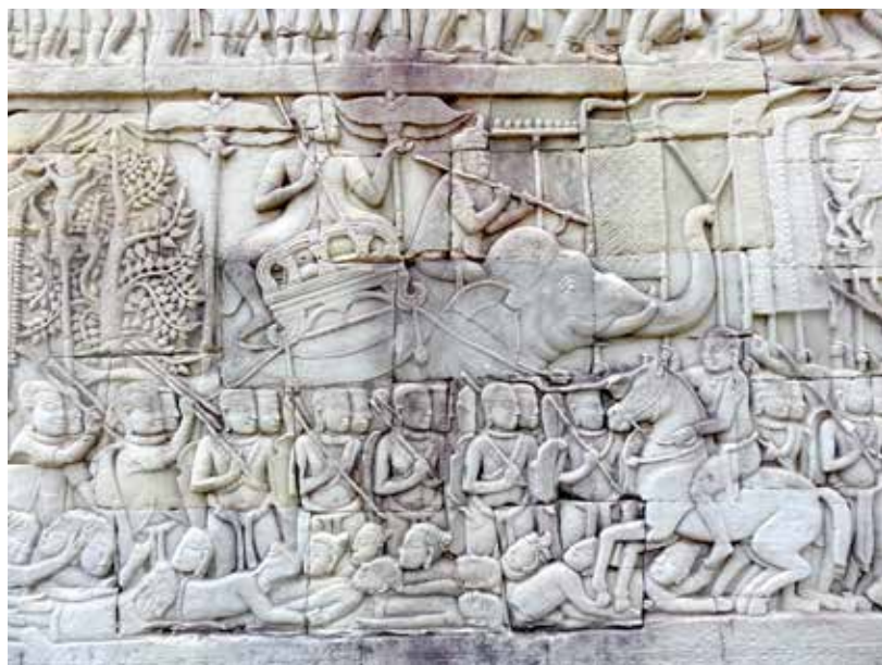
Fig. 9 Image of a bas-relief sculpture from the Bayon showing felled soldiers.