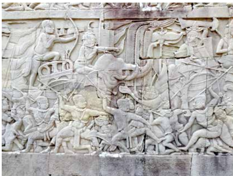
Fig. 8 Image of a bas-relief sculpture from the Bayon showing armies fighting.