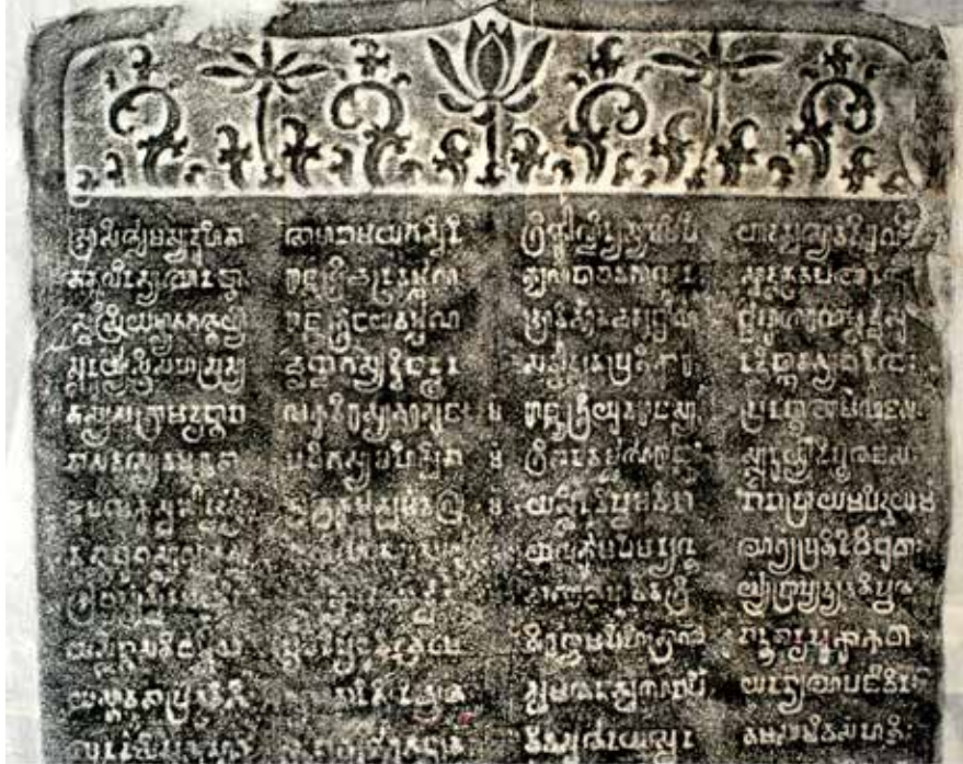
Fig. 3 Upper portion of EFEO estampage n. 1461 of K. 1141. The handsome calligraphy and beautiful lay-out — in which the metrical structure is visible at a glance (cf. Fig. 4), since the verse-quarters are separated by horizontal spaces, giving the impression of four columns of text — is not untypical of Khmer epigraphy.

kṣaṇaṃ pādāvagāhena svādūkr̥tapayonidheḥ