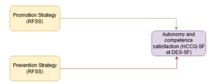
Figure 1. Tested model of the relationships between RFT and autonomy and competence satisfaction.

Recently, researchers have explored the relationship between SDT and RFT.9-11 Laroche and colleagues highlighted the fact that the relationship between RFT and the amount of physical activity is mediated by the different types of motivation described in SDT.<sup>10</sup> Vaughn observed that there is a relationship between the feeling of competence and autonomy related to a past event and the labeling of this event as meeting a promotion or prevention goal. 11 Participants were asked to recall certain past events. They were then asked to provide information on the level of autonomy and competence they felt about this event and to classify each event as meeting a promotion goal (i.e., aiming to achieve an ideal) or meeting a prevention goal (i.e., aiming to fulfill one's duties). When participants reported a higher perceived level of autonomy and competence, they were more likely to label the goal related to that event as a promotional goal. Conversely, when participants reported a lower level of perceived autonomy and competence during the event, they were more likely to label the goal of the event as a prevention goal. Vaughn also tested the relationship in the opposite direction. 11 To do this, a promotion or