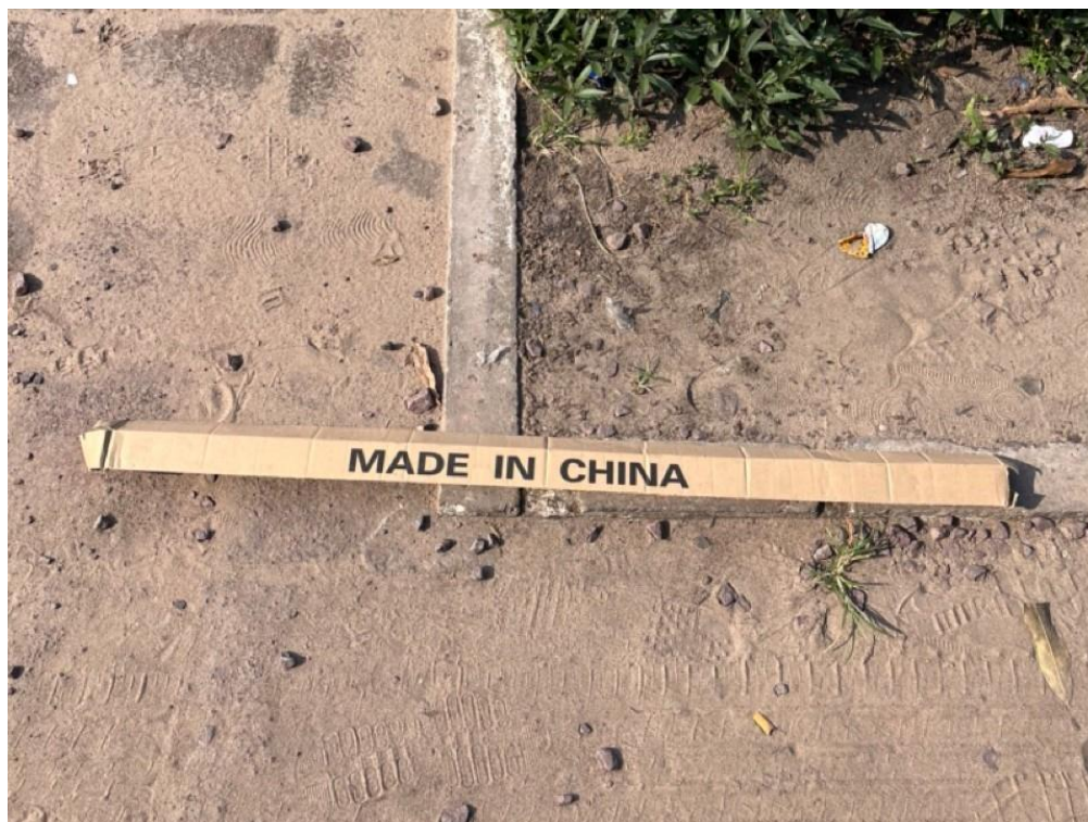
“Boulevard 30 juin (Kinshasa)” by the author on 15 December 2022