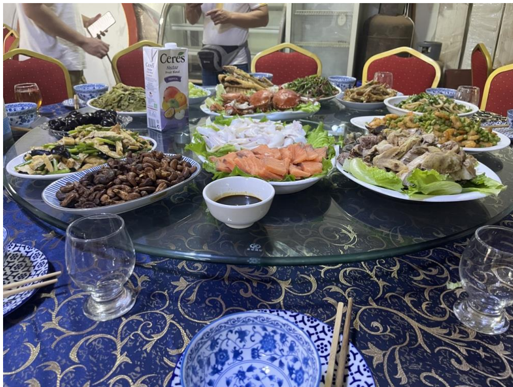
“Chinese New Year Gathering” by the author on 21 January 2023

As a PhD student residing in Europe, my social and cultural position accentuated the social distance with my Chinese interlocutors, many of whom come from rural or working-class backgrounds. They often referred to me as “ daxue sheng ” (college student), rather than using my name or “ xiao chen ” (Chen junior), a term reserved for the more privileged individuals with a university education in China. Despite this, coming from rural milieu myself, I was familiar with their sociability and language. To bridge the social gap, I made concerted efforts such as sharing meals, adjusting my language register, and even altering my hairstyle (from a trendy, slightly long haircut to a finger length) to foster a more authentic connection. Moreover, I extended my assistance with translation or IT needs. In contrast, the dynamics with those working as ‘translators’ in large Chinese companies were different, given that they all received higher education like me at the time and speak decent French.