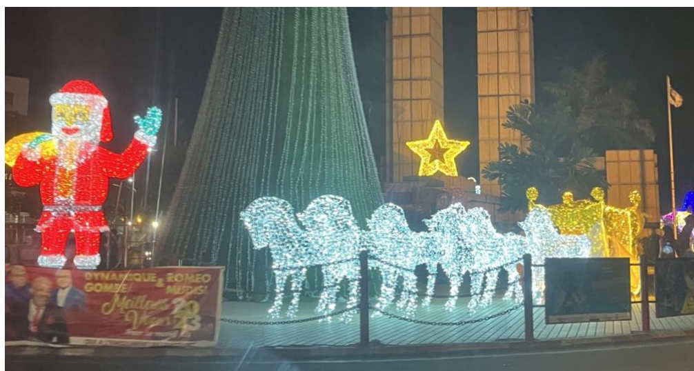
"Arrived in Kinshasa. Santa too!" by the author on 14 December 2022