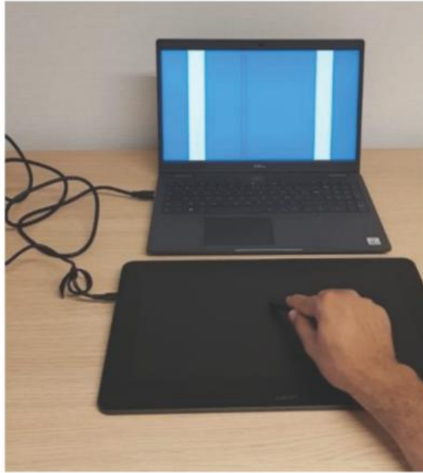
Figure 1. Motor task.