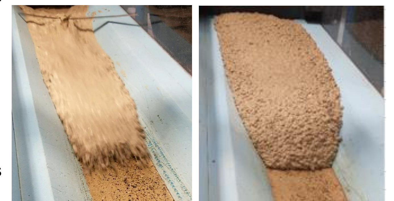
Fluid propagation in small flume Viscous