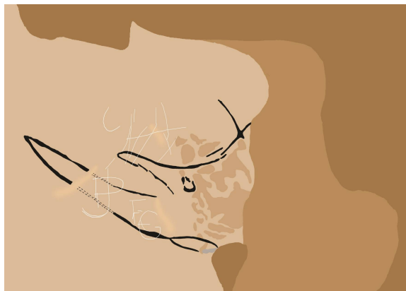
Fig. 4. Margot Cave (Mayenne). The head of this rhinoceros was engraved at the edge of a crack in the wall, as if the animal was emerging from it. Photo Hervé Paitier (at top); drawing Philippe Thomas (at bottom).