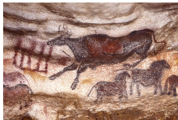
Fig. 6. Lascaux (Dordogne). "Jumping cow" whose volume is accentuated by the rocky relief.