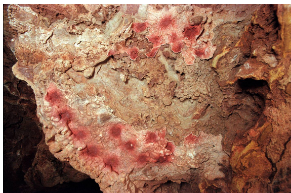
Fig. 5. Moulin de Laguenay (Corrèze). Lines of red dots following a rocky ridge.