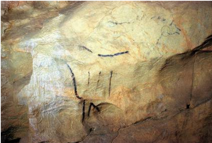
g. 9. Le Pergouset (Lot). Rock bank transformed into a fish (sturgeon?) by adding an eye and gills. Drawing Michel Lorblanchet. After Lorblanchet (2018).