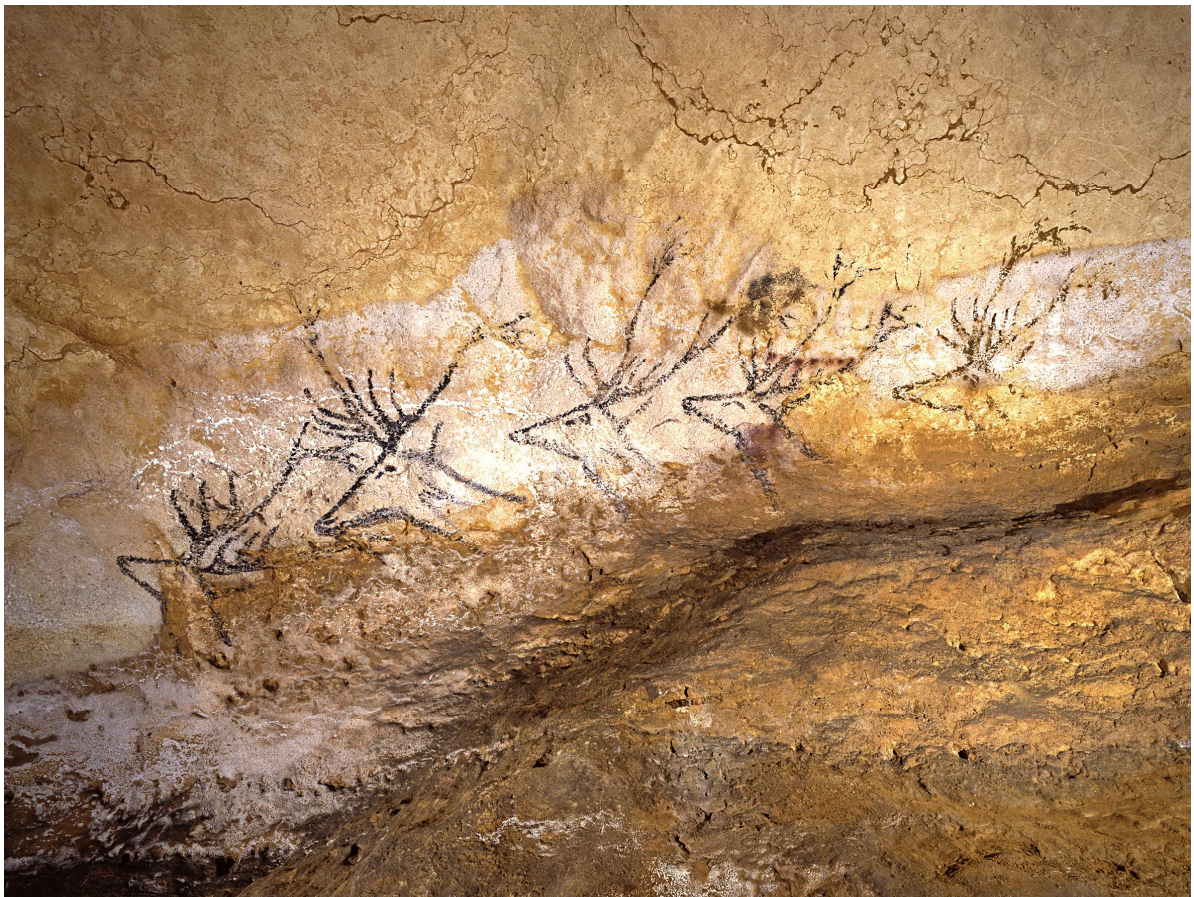
Fig. 8. Lascaux. Frieze of "swimming deer", where an clay on the wall suggests the possible movement of water.

Sometimes the relief is so obvious that the artist adjusts it underlined by a few additions such as this rock block transformed into a sturgeon (Le Pergouset, Lot) (Fig. 9). But in some cases, they may be “discrete 46 ” forms, such as, at Mayenne-Sciences, the microfossil that outlines the beginning of the neck of horse n°16 (Fig. 10). This particular and accentuated form of use of reliefs means that the wall has necessarily been inspected in detail. It is excluded that the artist discovered them while drawing; the insertions in the plot are too perfect.