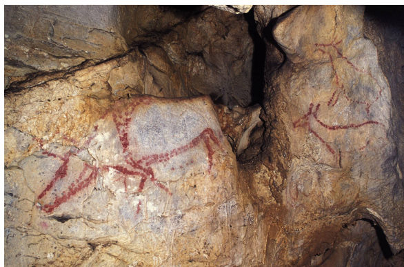
Fig. 3. Las Covalanas (Spain). These hinds seem to come out or enter a crevasse.

Most often, the drawing is positioned on the volumes, in order to give them more life, this « jumping » cow springs from the wall, thanks to the exploitation of the different volumes, which makes its legs appear closer than the rest of his body (Fig. 6).