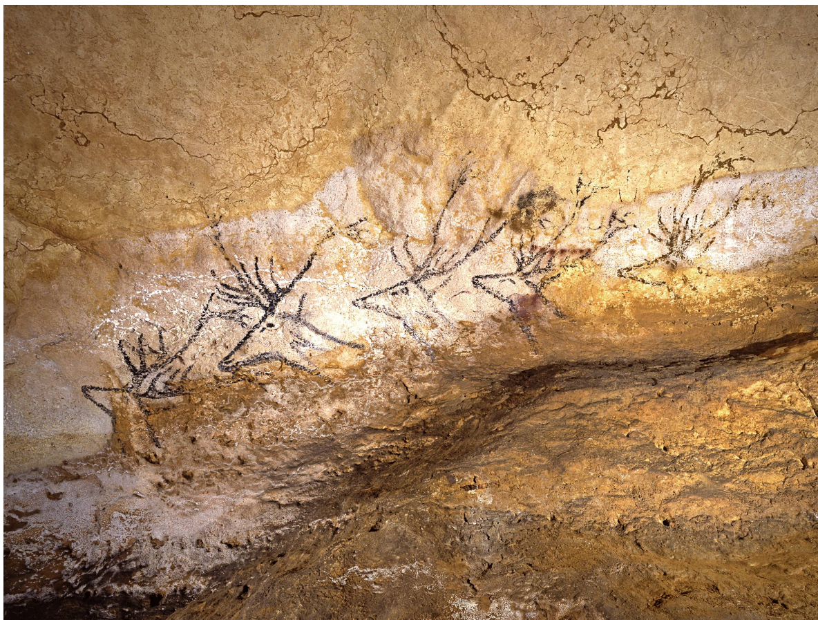
Fig. 8. Lascaux. Frieze of "swimming deer", where an clay on the wall suggests the possible movement of water.

Sometimes the relief is so obvious that the artist adjusts it underlined by a few additions such as this rock block transformed into a sturgeon (Le Pergouset, Lot) (Fig. 9). But in some cases, they may be “discrete 46 ” forms, such as, at Mayenne-Sciences, the microfossil that outlines the beginning of the neck of horse n°16 (Fig. 10). This particular and accentuated form of use of reliefs means that the wall has necessarily been inspected in detail. It is excluded that the artist discovered them while drawing; the insertions in the plot are too perfect.