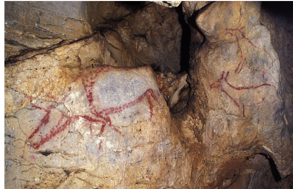
Fig. 3. Las Covalanas (Spain). These hinds seem to come out or enter a crevasse.

Most often, the drawing is positioned on the volumes, in order to give them more life, this « jumping » cow springs from the wall, thanks to the exploitation of the different volumes, which makes its legs appear closer than the rest of his body (Fig. 6).