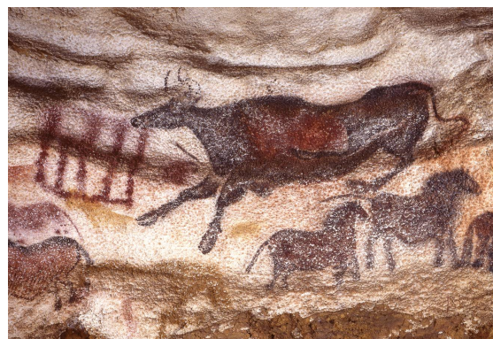
Fig. 6. Lascaux (Dordogne). "Jumping cow" whose volume is accentuated by the rocky relief.