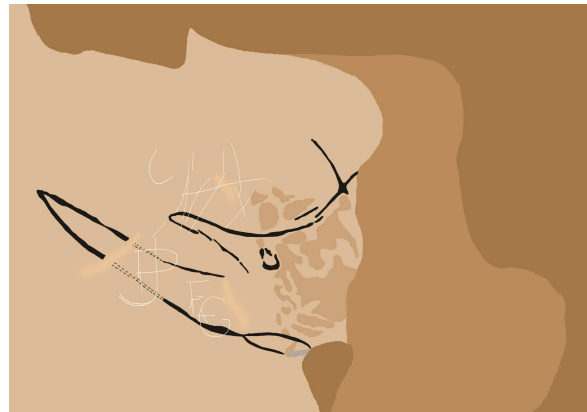
Fig. 4. Margot Cave (Mayenne). The head of this rhinoceros was engraved at the edge of a crack in the wall, as if the animal was emerging from it. drawing Philippe Thomas (at bottom).