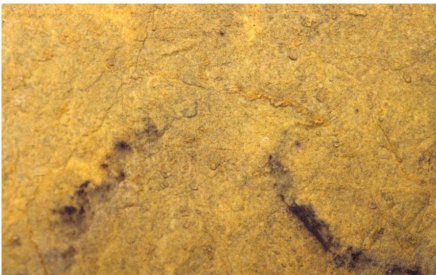
Fig. 10. Mayenne-Sciences (Mayenne). The origin of the neck of this horse is formed by a microfossil (black circle on the photo at top; detail at bottom).