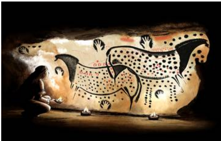
Fig. 7. Pech-Merle (Lot). Panel of “punctuated horses”. The head of the one on the right is inscribed in a rocky beak which already evokes the protome of an equine. Drawing Éric Le Brun. After Le Brun (2022).

First, we have an “implicit use” or “luminary”, there is the « plastic rhyme 42 », an expression coined by the painter Pierre Soulages. There is no direct insertion of the relief in the plot. This one is content to double or imitate it 43 . The graphic unit is glued against the relief, which serves as a graphic template; there are also imaginary ground lines, formed by the cracks or the edges of the walls directly above the representations. The shape of the wall constrained the artist here, by strongly suggesting which theme to choose for his drawing, like a graphic “pattern”. The layout follows or imitates a relief on the wall, like the head of this horse from Pech-Merle which itself imitates an animal