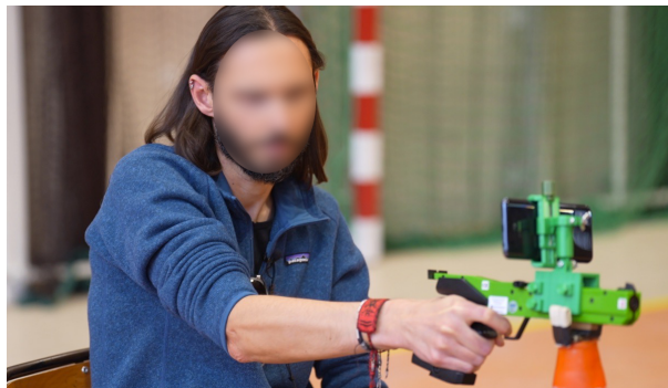
Figure 1: A visually impaired participant using the Multisense Blind Shooter system : an ordinary gun combined with a mobile phone rendering audio feedback.

The Multisense Blind Shooter mobile application was developed with ease of access in mind. Four sound renderings are currently available on the application until they can be compared and eventually mixed and optimized. The smartphone fits into a 3D printed holder that is attached to a conventional shooting weapon (1). This simplifies the equipment needed for clubs by allowing visually impaired people to use their own phones.