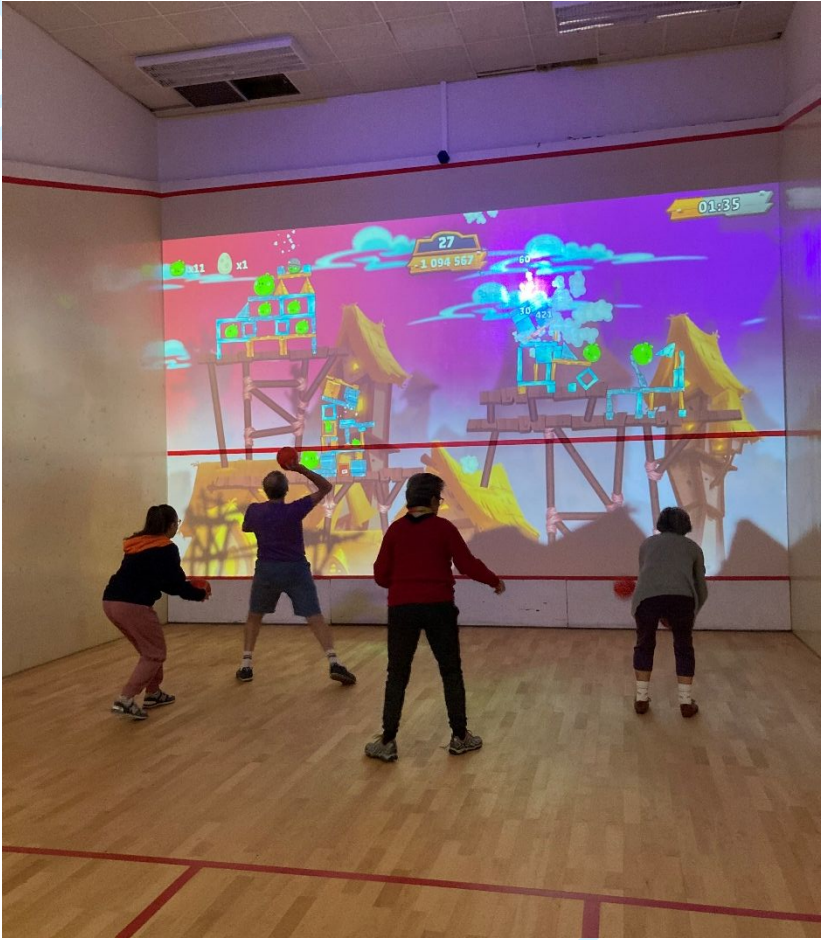
Figure 1. Neo One device

1 2 3 4 5 6 7 8 9 10 11 12 13 14 15 16 17 18 19 20 21 22 23 24 25 26 27 28 29 30 31 32 33 34 35 36 37 38 39 40 41 42 43 44 45 46 47 48 49 50 51 52 53 54 55 56 57 58 59 60