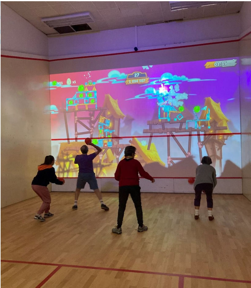
Figure 1. Neo One device