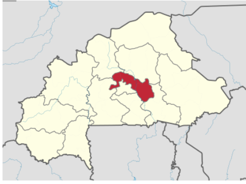
Figure 1: Burkina Faso Plateau Central Region