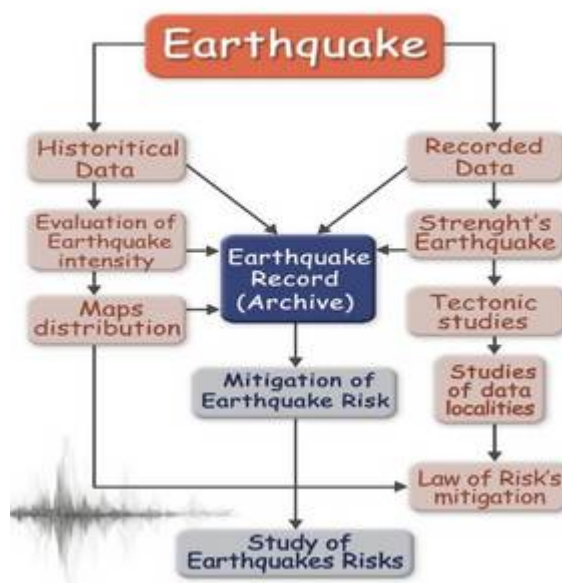
Fig. 2. General plan in seismology and tectonics (from Morabet Azroual, 2005)

the extent of its spread, the number of victims caused by it, its damages, its natural effects, its impact on landforms and the phenomena associated with it. This gives to these sources a great value and importance, as the extrapolation of historical data helps to evaluate the intensity of earthquakes. It also allows -Besides extrapolation of automatic seismic data provided by monitoring devices- the production of the seismic record of a specific region, which purpose is to study the seismic risk in order to reduce it (Fig. 2).