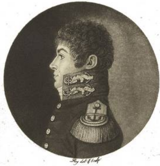
Fig. 10. Louis de Freycinet (1779-1841)

In 1818, some 15 years after Baudin's departure from Australian shores, one of his former lieutenants, Louis de Saulces de Freycinet (1779-1841) (Fig. 10), returned in the Uranie in command of his own expedition. He was the first in a succession of officers who had participated in earlier voyages to Australia and who would later return leading their own expeditions. Born in Montélimar in southeastern France, he joined the French Navy at the age of 14 and took part in several engagements against the British before his appointment to the Baudin expedition. On his first voyage Freycinet had played a major part in charting the remaining unknown part of the continent's southern coast and, in 1811, had published the first complete map of the Australian coastline. The primary aim of his new mission was to conduct research into the shape of the globe [ la figure du globe ] and the elements of terrestrial magnetism. When time allowed during stopovers, he was also to carry out studies into the three kingdoms of nature and to facilitate the collection of specimens (Freycinet, 1826, pp. XIII-XIV).