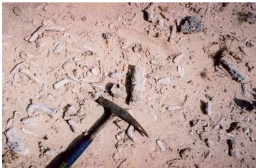
Fig. 16. Fossilised tree roots on Bald Head, Western Australia