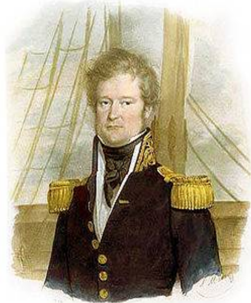
Fig. 15. Jules Dumont d'Urville (1790-1842)

d'Urville positively identified the location at the island of Vanikoro.