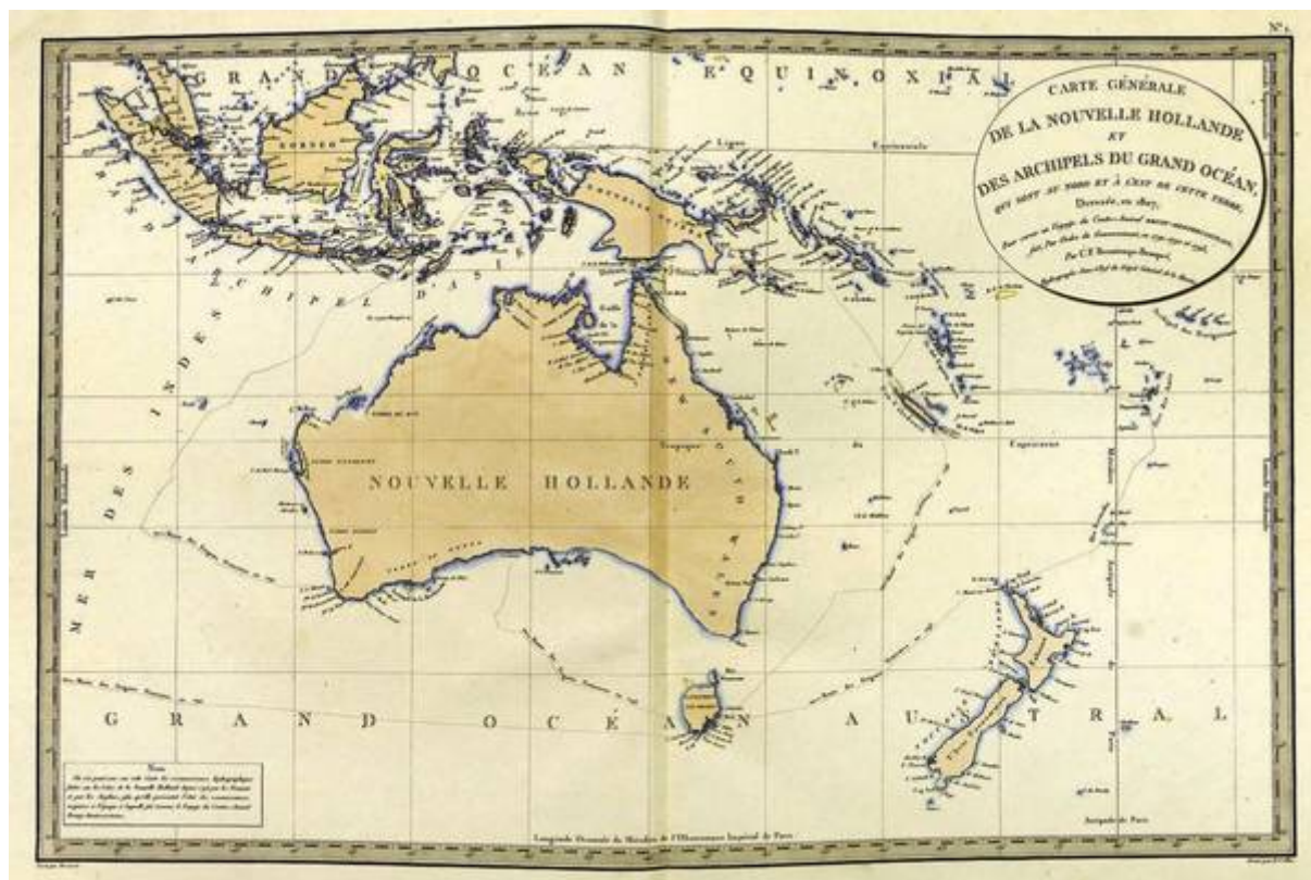
Fig. 2. Map of Nouvelle Hollande (Australia), showing the yet uncharted southern coastline of the continent and parts of Tasmania when d'Entrecasteaux's commenced his surveys in 1792

horizontal, as well as the plateau on the summit.” (Fig. 3) (Duker & Duyker, 2001, p. 131).