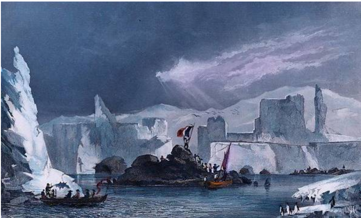
Fig. 17. First landing in Antarctica and raising the French flag on Rocher du Débarquement

yielded no more than small flakes. Fortunately, they soon found large, loose pieces of the stone and loaded them into their boats, enough, according to one officer, " to supply specimens to all the museums in France ". The general views among the naturalists and officer, including those of Le Guillou and Hombron, were that the Antarctic rocks were a type of coarse-grained granite or gneiss. With the benefit of present-day analysis, they have been described as paragneiss (Fig. 18) and amphibolite (Fig.19) (Godard et al. 2017). These specimens would represent undisputed proof to the world of the discovery of a southern land. The officers on board the two ships also succeeded in establishing the coordinates for the site of the south magnetic pole, but as it lay deep in the southern continent, they were unable to reach it.