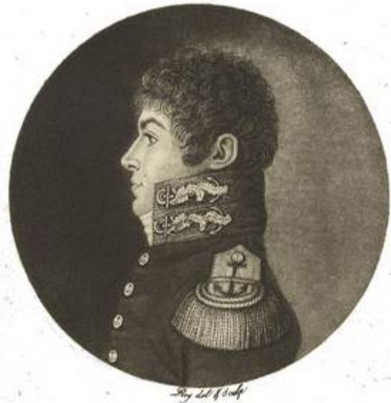
Fig. 10. Louis de Freycinet (1779-1841)

In 1818, some 15 years after Baudin's departure from Australian shores, one of his former lieutenants, Louis de Saulces de Freycinet (1779-1841) (Fig. 10), returned in the Uranie in command of his own expedition. He was the first in a succession of officers who had participated in earlier voyages to Australia and who would later return leading their own expeditions. Born in Montélimar in southeastern France, he joined the French Navy at the age of 14 and took part in several engagements against the British before his appointment to the Baudin expedition. On his first voyage Freycinet had played a major part in charting the remaining unknown part of the continent's southern coast and, in 1811, had published the first complete map of the Australian coastline. The primary aim of his new mission was to conduct research into the shape of the globe [ la figure du globe ] and the elements of terrestrial magnetism. When time allowed during stopovers, he was also to carry out studies into the three kingdoms of nature and to facilitate the collection of specimens (Freycinet, 1826, pp. XIII-XIV).