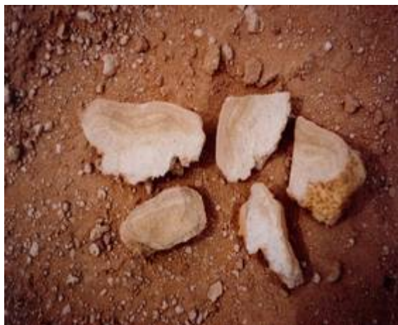
Fig. 11. Concentric layers in calcareous concretions

nodules with concentric layers in their interior and irregularly disturbed through the sedimentary layers (Fig. 11). While the former had believed that these concretionary bodies had formed prior to being included into the sediment, to which he referred as a breccia, Quoy concluded that they had formed in situ and stated that, “ those who believe that these globules have been transported deceive themselves; I attribute their formation to a kind of crystallisation ” (Freycinet, 1826, pp. 472-476).