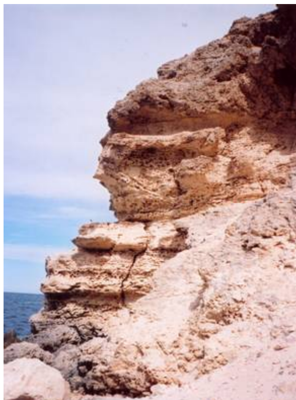
Fig. 9. Horizontal strata of the Pleistocene Tamala Limestone

On their separate excursions to survey the geology along the coast of Western Australia, the mineralogists and Péron recognised a sequence of calcareous sedimentary rocks composed of an aeolian sequence containing petrified tree trunks and root and of marine interbeds with various species of molluscs. The shells in these strata were like those found " living on the beaches in front of the stratified cliffs. " He assigned the strata to the Secondary and agreed that they were of a geologically young age and had in recent times emerged from the sea (Fig. 9) (Péron & Freycinet, 1816, pp. 92, 142-146). The two geologists and Péron also concluded the rock sequence found along the Swan River and on Rottnest Island in the southwest of the state were the same as those they examined in Shark Bay, more than 700 km to the north (Fig. 7). We recognise this formation today as the Tamala Limestone of Pleistocene to Early Holocene age (Mayer, 2008; Playford, 2006; Kendrick 1991).