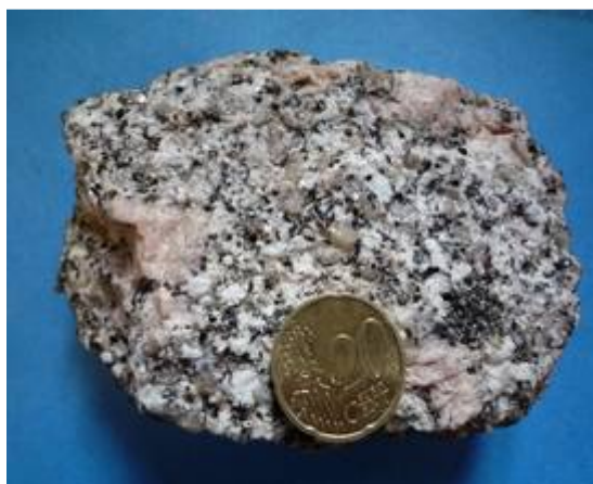
Fig. 18. Proterozoic paragneiss collected on Rocher du Débarquement