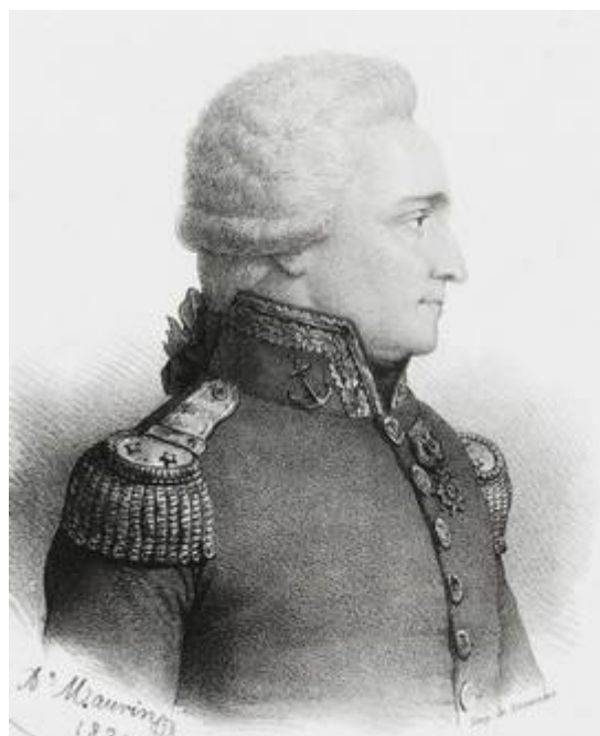
Fig. 1. Bruni d'Entrecasteaux (1737-1793)

In 1791, the French National Assembly authorised an expedition to the South Seas with the aim of searching for the missing La Pérouse and his crew, who had not been heard of since his ships had anchored at Botany Bay in 1788. At the urging by members of the Société d'Histoire naturelle , the expedition was given the additional task of charting the continent's unknown coasts and to study its natural history. Bruni d'Entrecasteaux (Fig. 1), was appointed commander of the voyage and sailed from Brest with the frigates Recherche and Espérance . He was a native of Aix-en-Provence and the son of a member of the Parlement de Provence . After joining the Navy at the age of 17 he saw service in the Far East, and in 1785 was appointed as Governor of Isle de France and Isle de Bourbon.