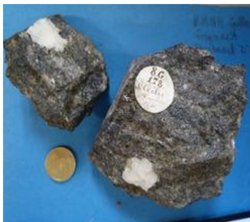
Fig. 19. Proterozoic amphibolite collected on Rocher du Débarquement

In the introduction to his account of the voyage, Dumont d'Urville acknowledged at great length the difficulty faced by naturalists in exploring the lands they visited, given their often-limited time spent ashore and recognised that this applied particularly to geological investigations. He was aware that, “geological observations require a much greater precision than are needed for other sciences. In zoology and botany an individual specimen can have great importance, but a rock specimen on its own has no value if you do not know the precise point from where it has been collected, the rocks on which it rests, the layer it has been taken from and those which overlie it. The making of geological observations must always proceed by the exact and precise knowledge of places and the descriptive anatomy of formations. It is only after this study that general considerations of the origin and the age of regions can be raised” (Dumont d'Urville, 1841-1853, v. 1, pp. VII-XV).