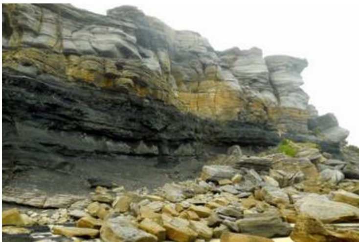
Fig. 5. Triassic sandstone with coal seams, first recorded by the botanist Labillardière in 1792