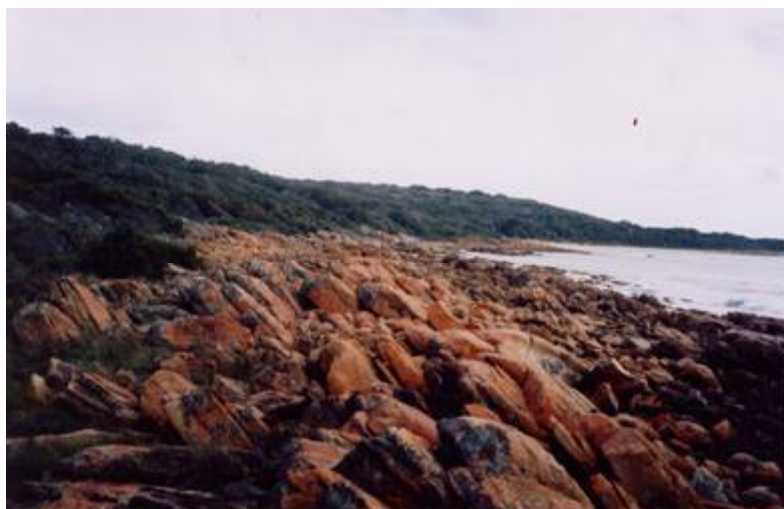
Fig. 8. Outcrop of Precambrian granite gneiss at Geographe Bay in Western Australia. Depuch considered these rocks to show stratification