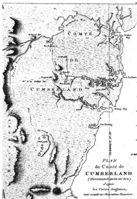
Fig. 12. Map du Comté de Cumberland

He divides the land into two natural divisions: the plains and the mountains (Fig. 12). The former is an undulating terrain in the midst of which rise some small, isolated hills, extending from the seashore to the foothills of the Blue Mountains. The rocks he identified were quartz sandstones, which in coastal cliffs can be seen to form immense horizontal beds “ a wall of rocks ” and grey, horizontally layered shales [the Triassic Hawkesbury Sandstone and the overlying shales of the Wianamatta Group, respectively, forming part of the Sydney Basin sequence]. He also noted a small hill [Prospect Hill] protruding from the plain composed of an almost black igneous rock, which he referred to as ‘ophite’ [a dolerite laccolith of Early Jurassic age].