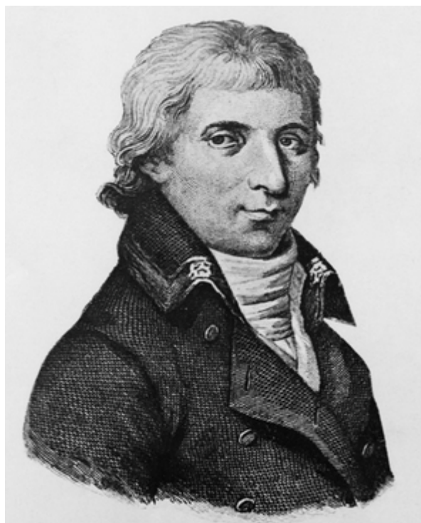
Fig. 6; Nicolas Baudin (1754-1803)