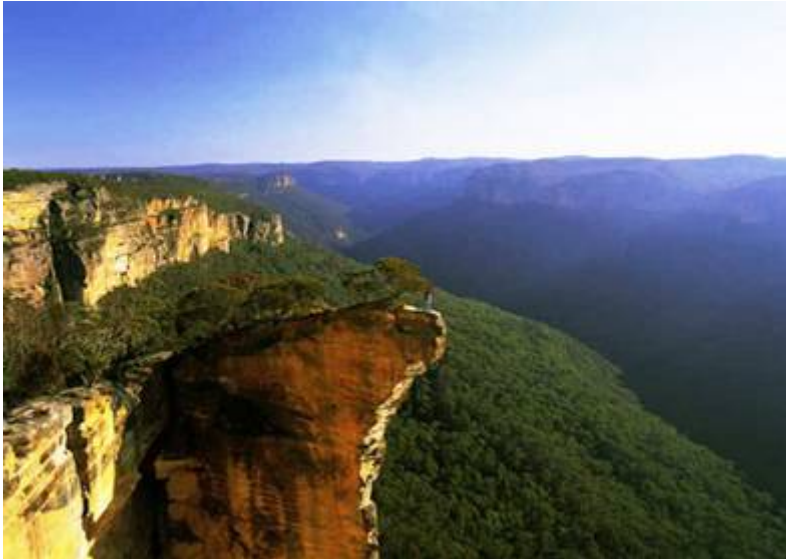
Fig. 13. Blue Mountains. The cliffs walls in valleys have a concave shape

It reminded him of the similar appearance of sea cliffs where wave erosion had given them a concave shape at their base. It led him to conclude that only the action waves could have shaped these cliffs. He was not alone in reaching this conclusion. When some 17 years later Charles Darwin visited the Blue Mountains, he became convinced that the valleys had been carved out by an ancient inland sea.