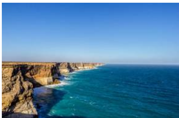
Fig. 3. Horizontal strata of Tertiary calcareous rocks exposed in cliffs along the coast of South Australia, described by d'Entrecasteaux

It seems rather ironic that the longest uninterrupted period Riche spent on land on the continent's southern coast was the time when he became lost. During a stopover at Esperance Bay, he had gone ashore with a surveying party but became separated from them. During the more than