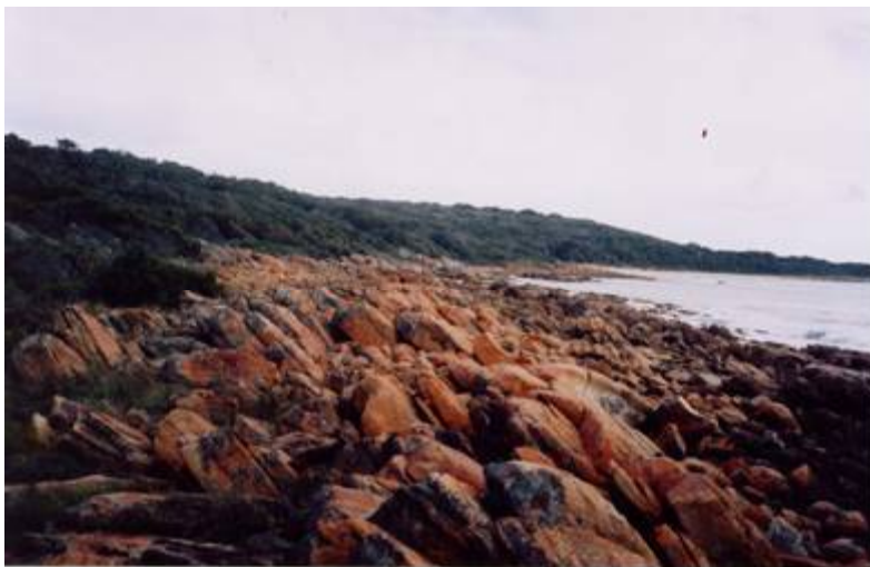
Fig. 8. Outcrop of Precambrian granite gneiss at Geographe Bay in Western Australia. Depuch considered these rocks to show stratification