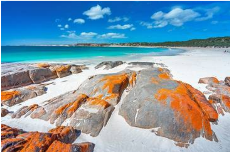
Fig. 4. Outcrops of Archaean granite on the southern coast of Western Australia, like that seen by Claude Riche in 1792

Jacque-Julien Houtou de Labillardière (1755-1834), the expedition's botanist, whose journals and collections were in time returned to him, displayed his versatility as a scientist when he discovered a coal seam at South Coast Bluff in Tasmania (Duyker, 2003, p. 145). The seam, now known to be of Triassic age and interbedded with sandstone was only a few centimetres thick (Fig. 5). Based on his apparent knowledge of European coal measure sequences, in many of which coal is associated with sandstone layers, he predicted that more substantial seams of coal would be discovered in this area. Coal was indeed mined in this region some decades later. Labillardière also speculated on the occurrence of iron ore in the area based on his noting of rust-coloured water in a stream.