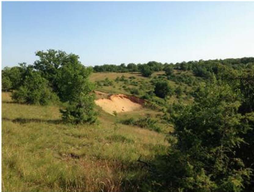
Fig. 4. Photograph of doline near Rocamadour.

the subsurface and then spring forth downstream into the course of the surface stream, Paramelle took this phenomenon as a universal. This idea may seem quaint to us, but in Paramelle's time, water was thought to flow primarily through natural underground conduits.