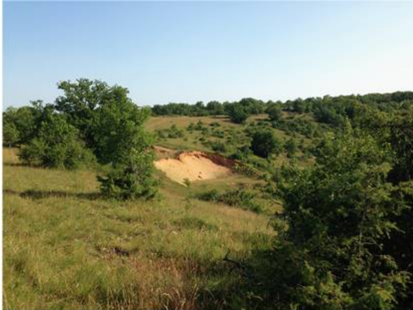
Fig. 4. Photograph of doline near Rocamadour.

the subsurface and then spring forth downstream into the course of the surface stream, Paramelle took this phenomenon as a universal. This idea may seem quaint to us, but in Paramelle's time, water was thought to flow primarily through natural underground conduits.