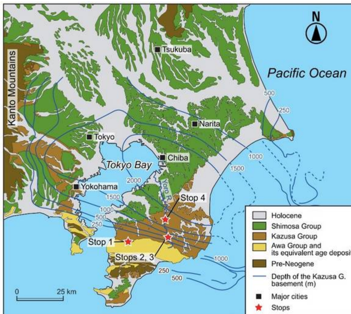
Fig. 3. The locality of Chibanian ( Okada, 2023). Stop 4 is type locality of Chibanian.

Japanese geologists proposed to name “Chibanian” the geological time period ranging between from 1.29 to 0.774 Ma. Type locality is in the Boso Peninsula, 60km SE from Tokyo (Fig. 4). The Boso Peninsula is composed of thick Quaternary strata deposited in the Paleo Tokyo Bay. The type locality of Chibanian shows more than 5000 m depth of basement. The paleo Tokyo Bay opened to north and was larger than