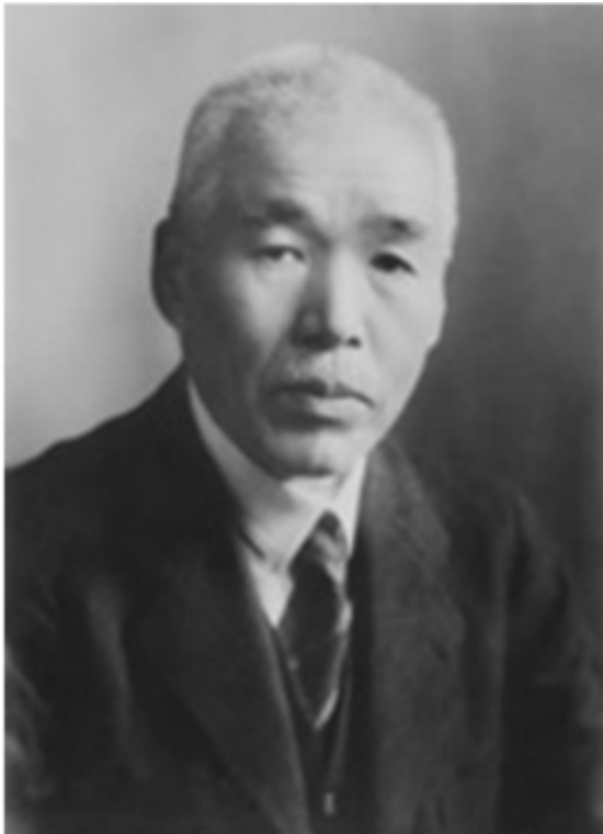
Fig. 1. Matuyama, Motonori (Yamasaki, 2005)

Brunhes-Matuyama reversal (Fig; 2), the reversed magnetic polarity interval from 2.58 to 0.773 Ma that we now call the Matuyama Reversed Polarity Chron was proposed in 1964 (Cox et al.).