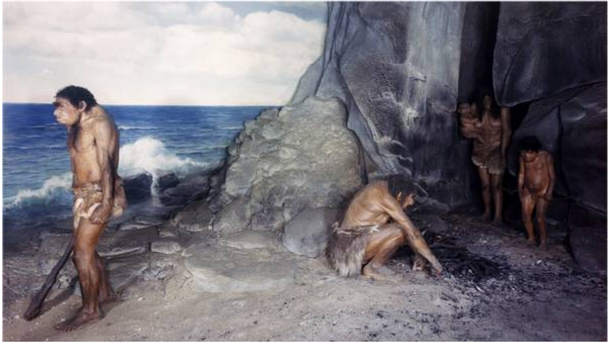
Fig. 7. The Field Museum unveiled two dioramas of Neanderthals in 1929, for which Blaschke constructed the figures. Note the skin coloration, as well as the posture of the models.

its scientific inaccuracies. However, the Magdalenian girl skeleton remains on display within the Field Museum's Griffin Halls of Evolving Planet.