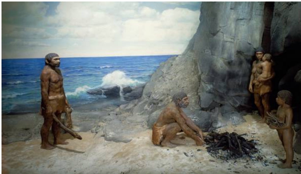
Fig. 9. In the 1970s, Joseph Krstolich replaced the Neanderthal diorama figures because they were inaccurate. Note that the skin coloration is still dark, but the posture of the models is erect. (© The Field Museum, Image No. A102513c, Photographer Ron Testa)