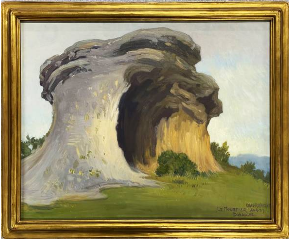
Fig. 5. Henry Field sponsored Knight's visit to the European sites of prehistoric humans, and he commissioned Knight to paint small oil landscapes. This 1927 painting of Le Moustier was one of five produced for Field.

Although Knight would not paint murals of Cro-Magnons or Neanderthals for the Field Museum of Natural History, he corresponded with Henry Field and offered his opinions and advice on the museum's early human exhibits. Henry Field was assembling The Hall of Man, whose dioramas he intended to show progression of prehistoric peoples, from Chelean, Acheuleen, Mousterian (including a Neanderthal skull from Le Moustier) to Aurignacian ('Old Man of Cro-Magnon'), to the Swiss Lakes Dwellers. In the 8 typed pages of the Proposed Plan for the Hall of Prehistoric Man by Henry Field 1927, Field wrote: « The painted background at the northeast end of the hall... will show a Swiss Lake Dweller village with the water in the background and the boats setting out on a fishing trip with mountains in the background, with their