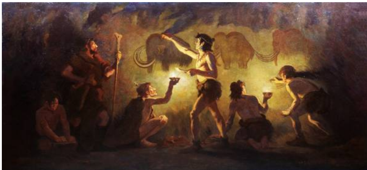
Fig. 4. Knight also painted the Cro-Magnon Artists of Southern France of the Font-de-Gaume grotto, Les Eyzies-de-Tayac in 1920 for the American Museum of Natural History. Note the skin and hair coloration of the early artists. Knight's cave painting depicts a line of mammoths, which Knight later learned was incorrect.