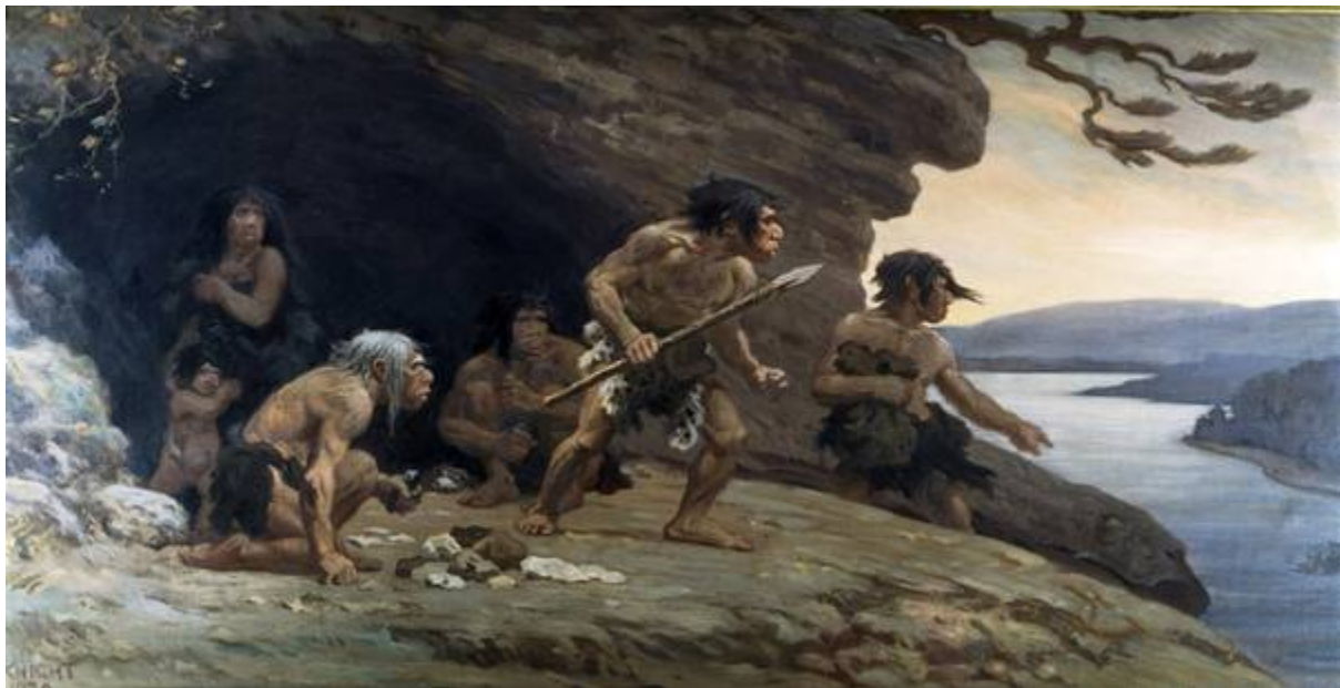
Fig. 3. In 1920, Knight painted the Neanderthal Flintworkers of Le Moustier Cavern for the American Museum of Natural History. Note the posture and skin coloration of the Neanderthals.

early hominins: the shorter, brutish Neanderthals, whose skin coloration was based on Australian aborigines, and taller, lighter skinned and artistic Cro-Magnons, which were presumably our direct ancestors (Milner, 2012; Sommer, 2010). In 1920, Knight painted the Neanderthal Flintworkers of Le Moustier Cavern, Dordogne, France (Fig. 3), and the Cro-Magnon Artists of Southern France of the Font-de-Gaume grotto, Les Eyzies-de-Tayac (Fig. 4). Knight's third mural painting featured Early Stone Age Man, a Neolithic community. He later wrote that with the Neolithic community: « We see... human beings, much like ourselves, in the first phases of civilization » (Knight, 1935, p. 118).