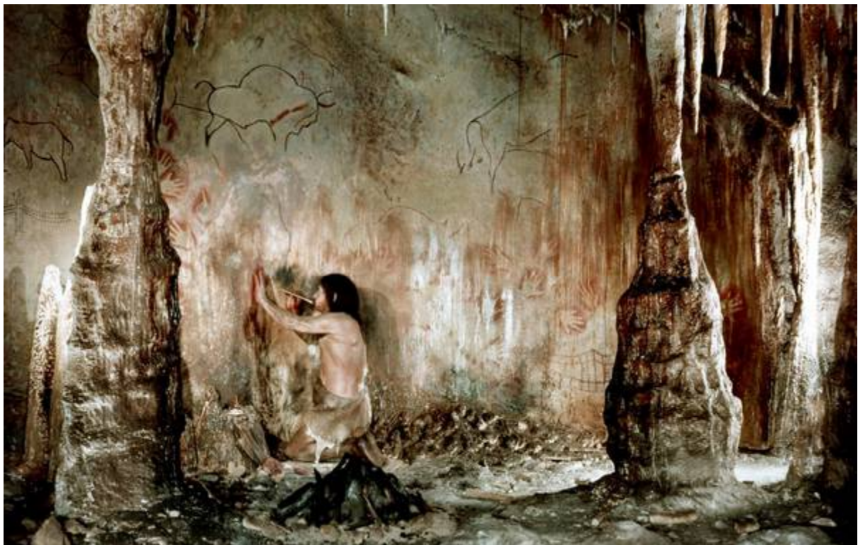
Fig. 8. The Field Museum unveiled additional dioramas in 1933 for the Hall of the Stone Age of the Old World. This diorama depicted a lighter skinned Cro-Magnon artist and cave art.