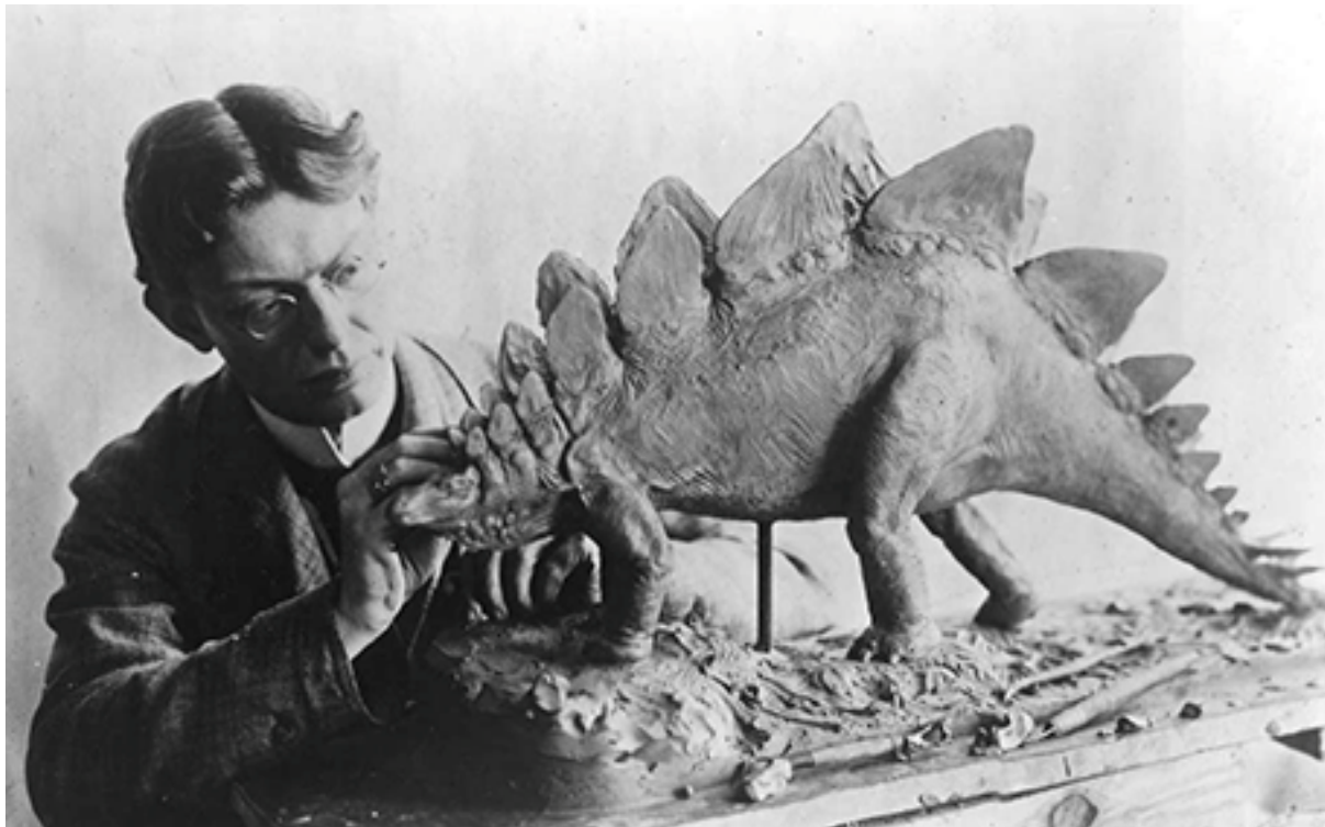
Fig. 1. Charles R. Knight (1874-1953) emerged as a prominent paleontological artist of the twentieth century. In this 1899 photograph, Knight is shown sculpting a Stegosaurus model.