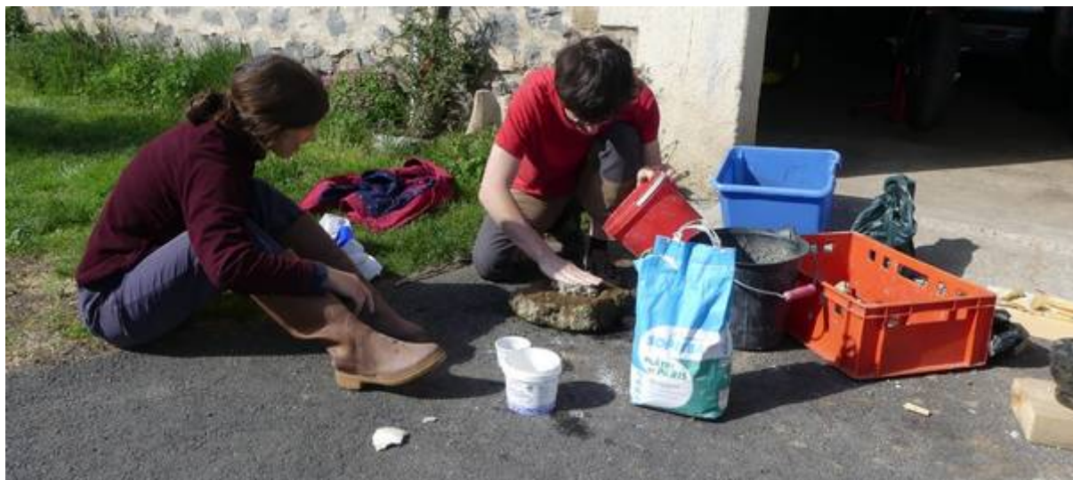
Fig. 2: Attempting to make a "Fossil Man" from rocks from " La Denise " site, plaster and bones, 2022, © Edgar Lhoste

The purpose of this short methodological section is simply to remind to the reader the two main aspects of historical work, namely the development of a corpus of sources and its analysis.