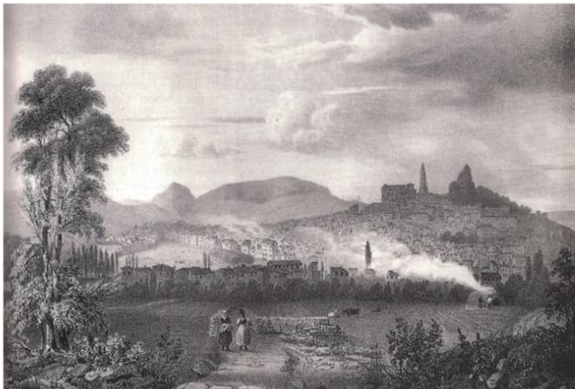
Fig. 7. View of the town of Le Puy, drawing by Viard, printed by Senefelder, 1800, Les Cahiers de la Haute-Loire , 1996. Gallica: https://gallica.bnf.fr/ark:/12148/bpt6k32056080/f267.item

In conclusion, we can ask what such a forgery tells us about the truth. As Claudine Cohen (1999) points out, fakes can have a “founding effect” (e.g., Moulin-Quignon) but it can also give rise to false theories (e.g., Piltdown man). It is also possible to think that forgeries can generate knowledge: the carving of tools from flint makes it possible to reconstruct prehistoric gestures in a heuristic way. But our case study shows something quite different.