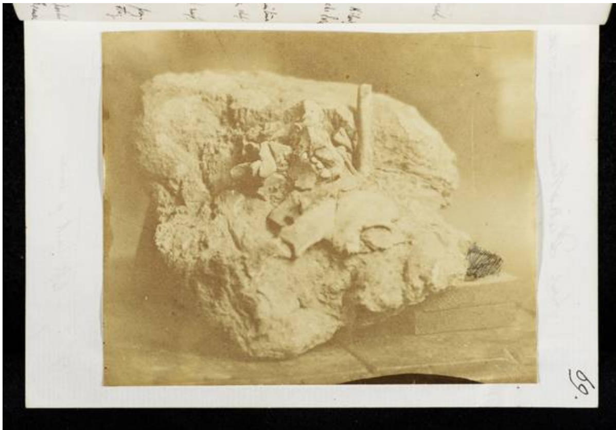
Fig. 3. Photograph showing the museum block, Charles Lyell Notebook 40, Folio 69, 1859 (?), Henri Malègue (?).

In 1844, at the time of the discovery of La Denise , the high antiquity of Man was not recognised by the scientific community, despite the discoveries of human bones associated with extinct fauna