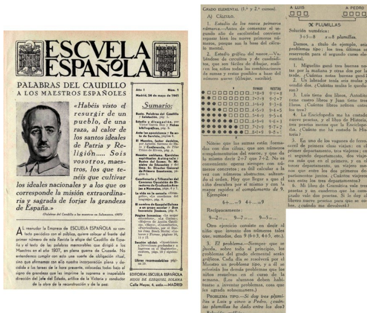
Figure 2: Cover of the first issue of Escuela Española , and one of the selected fragments

conceived for 6–7 years old pupils (Figure 2, right). Both of them included the reading and writing of numbers from 1 to 9, their interpretation as cardinals and ordinals, and basic ideas related to addition and subtraction (including easy verbal problems).