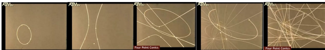
Figure 2: Five screenshots of Fletcher’s film titled the four point conics

There are three films by Fletcher available on the YouTube ATM channel, the Simpson line 7 , the previously mentioned the cardioid and the four point conics 8 . Due to the much higher complexity of Fletcher’s films compared to Nicolet’s, we limit ourselves to give a flavor of Fletcher’s films in the four point conics . The film is introduced by drawing the spectators attention to the fact that, although two different points determine a unique straight line and three non-collinear points determine a unique