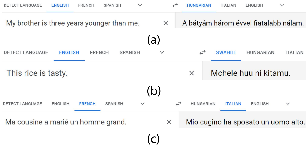
Fig. 2 Examples of language modeling bias in machine translation. a The lack of an equivalent common word in Hungarian for brother results in an erroneous translation meaning my elder brother is three years younger than me . b The lack of an equivalent term for rice in

Swahili results in an erroneous translation meaning this raw rice is tasty . c The systematic use of English as pivot language results in an erroneous change of gender when translating between French and Italian