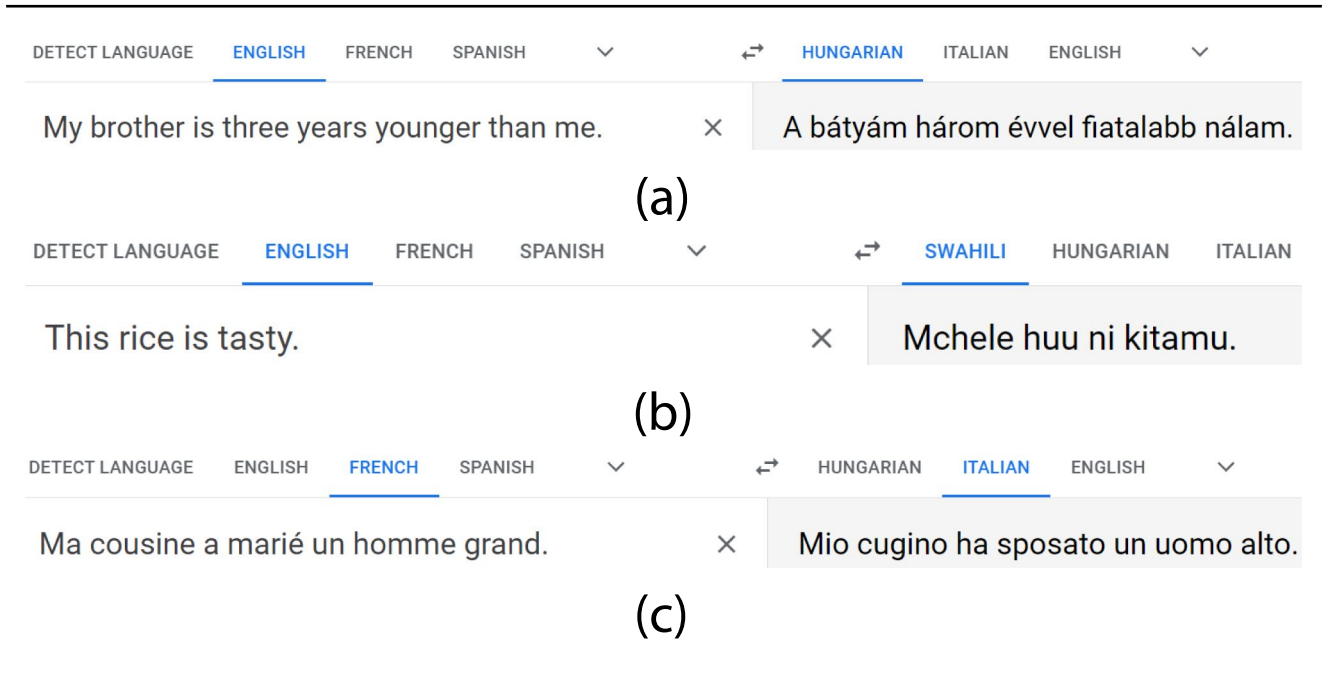
Fig. 2 Examples of language modeling bias in machine translation. a The lack of an equivalent common word in Hungarian for brother results in an erroneous translation meaning my elder brother is three years younger than me. b The lack of an equivalent term for rice in

two languages other than English. This practice is explained by the relative scarcity of bilingual training corpora for such language pairs, as well as scalability. Example (c) in Fig. 2 shows the case of French-to-Italian translation of a sentence meaning my (female) cousin married a tall man. While French and Italian (as do most languages) use different words for male and female cousins (cousin/cousine, cugino/cugina), English does not. The result is that the gender of the cousin is 'lost in translation' and, as a form of combined linguistic and gender bias, it appears as a male in the translation.