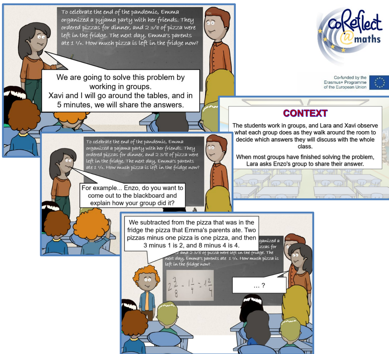
Figure 1: Cartoon vignette on Enzo's answer (translated key cartoon slides)

answers and the mathematical elements in it. (2) Starting from the answer by Enzo's group: If you were the teacher, what would you do next? [...]"