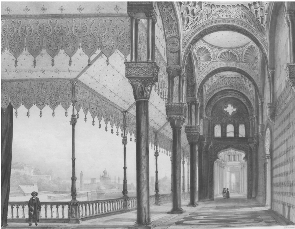
fig. 2: Villemin del., Théâtre Royal Italien. Vestibule dans l'Opéra de «Malek-Adel» par Mr. Ferri , lithograph after set by Domenico Ferri. Paris, Benard & Frey, [1837].

Ferri's prints reflect scenographic standards of the time, tied to Romanticism or more widely with the staging practices inherited from a long history and consecrated by administrative rules. These images obviously show sets which are utterly in phase with Romanticism. They depict arsenals and fortresses, medieval castles, nocturnal forests, gothic interiors and exotic exteriors. Not only the types of places chosen, but also the codes of representation used, correspond to a generic Romantic to-