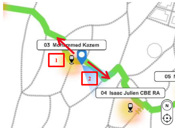
Figure 3: The group had to head towards Anadol's exhibit

In the following episode the children have passed Mohammed Kazem exhibit and before reaching the exhibit of Issac Julien CBE RA, they have a stop in order to get some photos. When they decided to go on with their visit they get confused as they are not sure which direction they have to follow (Figure 3).