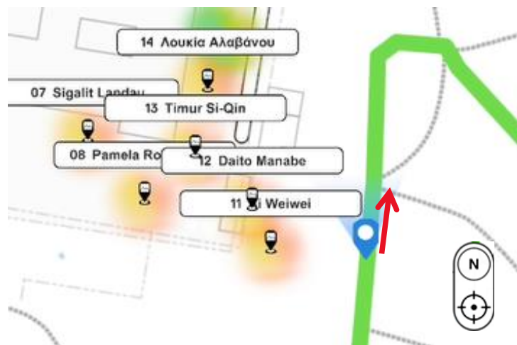
Figure 2: The children are following the green path indicated by the GPS application heading in the direction the red arrow is pointing. They decide to head towards the exhibits on their left

What is evident in the above episode is that children use as a frame of reference to define the direction they had to follow, the frame of reference of the screen (Latsi & Kynigos, 2012), defining the right direction as the direction that appears on the right part of the screen and referring to the two directions as up and down as they appear in the top and bottom of the screen accordingly. When they turn right the change in the position of the GPS entity on the screen helps them realize they took the wrong direction. Facing this inconsistency Child 2 employs her embodied experience during a path integration process in order to reason about the direction they had to follow. She supports her reasoning using a gesture to represent their movement. This embodied representation of the path integration process helped children realize that in order to find out which direction they have to follow they have to take into account not only their position but also to the direction they are heading while they are standing in the node. When, later on, Child 1 doubts again about the direction they need to follow to reach some exhibits located on their left, Child 3 reasons about the direction they need to follow also using her previous experience (Figure 2).