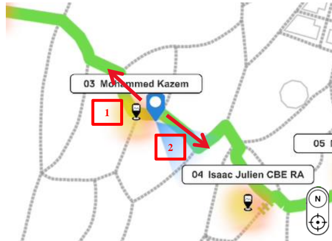
Figure 3: The group had to head towards Anadol's exhibit

In the following episode the children have passed Mohammed Kazem exhibit and before reaching the exhibit of Issac Julien CBE RA, they have a stop in order to get some photos. When they decided to go on with their visit they get confused as they are not sure which direction they have to follow (Figure 3).