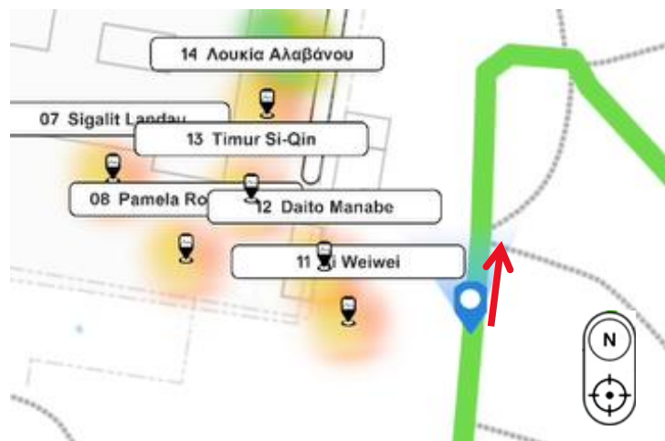
Figure 2: The children are following the green path indicated by the GPS application heading in the direction the red arrow is pointing. They decide to head towards the exhibits on their left

What is evident in the above episode is that children use as a frame of reference to define the direction they had to follow, the frame of reference of the screen (Latsi & Kynigos, 2012), defining the right direction as the direction that appears on the right part of the screen and referring to the two directions as up and down as they appear in the top and bottom of the screen accordingly. When they turn right the change in the position of the GPS entity on the screen helps them realize they took the wrong direction. Facing this inconsistency Child 2 employs her embodied experience during a path integration process in order to reason about the direction they had to follow. She supports her reasoning using a gesture to represent their movement. This embodied representation of the path integration process helped children realize that in order to find out which direction they have to follow they have to take into account not only their position but also to the direction they are heading while they are standing in the node. When, later on, Child 1 doubts again about the direction they need to follow to reach some exhibits located on their left, Child 3 reasons about the direction they need to follow also using her previous experience (Figure 2).