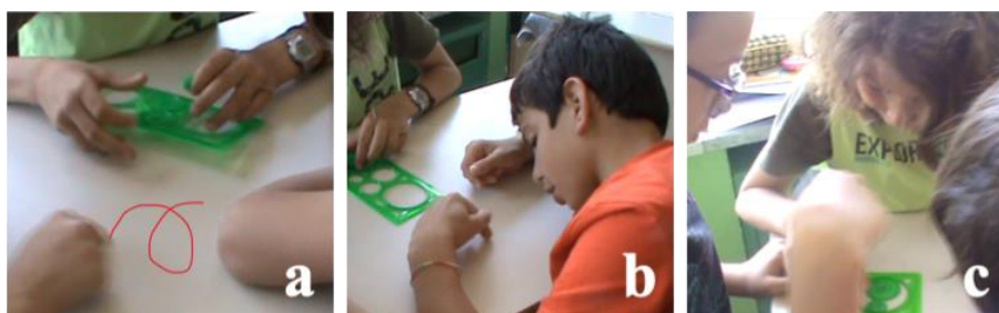
Figure 3. a) A draws a piece of the curve on the desk with her right-hand index finger; b) Al propagates the spiralling gesture on the desk, multiple times; c) P explores combinations of gears

This gesture propagates across the desk when Al replicates it (Figure 3b). On the other hand, P is more interested in comparing the different wheels: he superimposes them and looks for corresponding (“common”) holes or tries to combine more than one wheel inside one ring (Figure 3c).