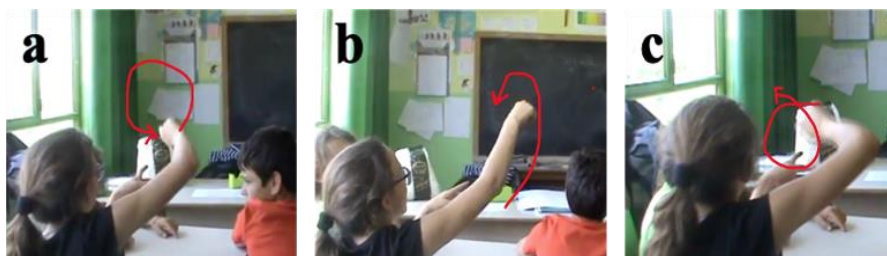
Figure 1. A gestures movement of the wheel (a) and the pen (b-c)