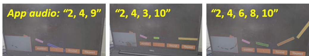
Figure 2: three snapshots from one child's 4-minute sequence of attempts to make the app say the 2 times table, iteratively placing rods, removing hands, and listening, before rearranging the rods