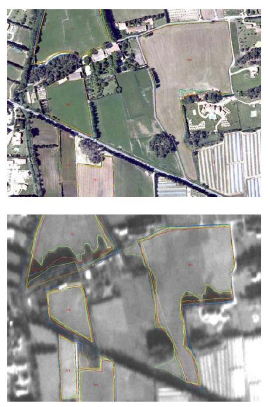
Figure 3. Example of area measurement on orthophoto and Cartosat1 images

parcel area and surrounding natural vegetation; and crops boundaries were delineated more often than parcels boundaries. We called it the ligneous overestimation effect.