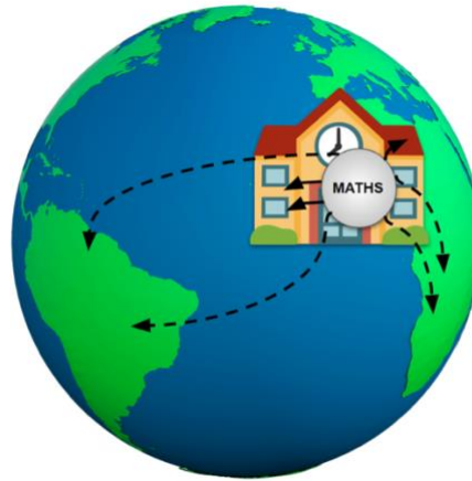
Figure 1: Different levels of mathematics understanding

itself, and it is a subject deeply connected to other subjects, a common language that enables to see patterns, to model and to predict different phenomena; outside the school environment, mathematics is a subject in relation to the real world, a means to build citizenship skills and understand the world (Figure 1).