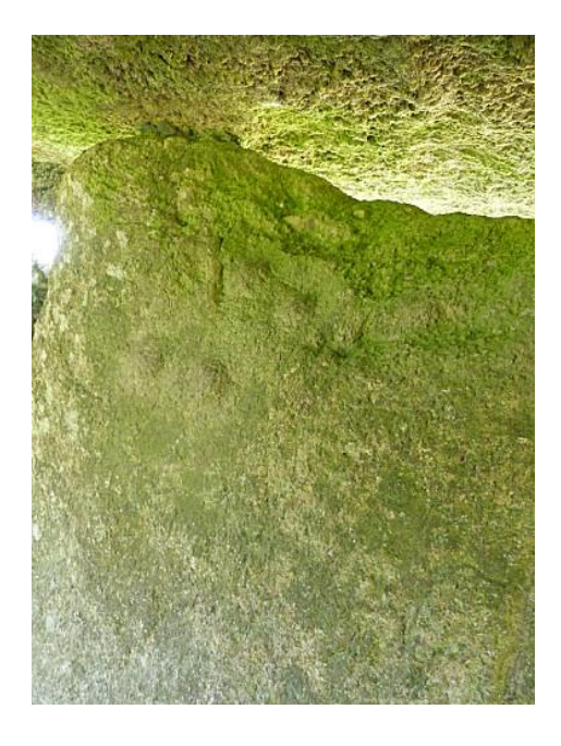
Two breasts close to the chamber http://www.sherry29.com/article-mougau-bihan-85678001.html

Lady of the Frout, mother and Virgin Good health to the child, and to us milk<sup>43</sup>!"