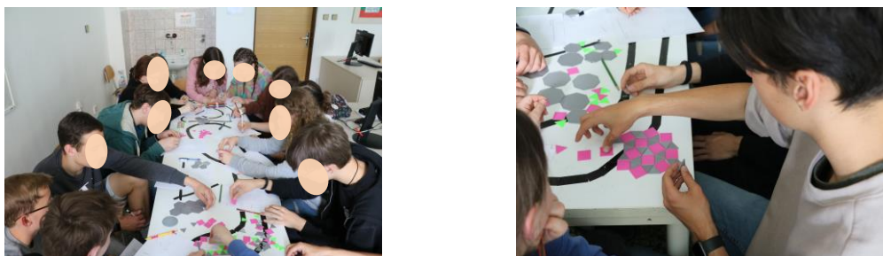
Figure 2: Students' activities with the construction sets of polygons

Students were given tasks on types of polygons, their properties and applications in tilings. All students learned about polygons in regular mathematics instructions in their previous studies. The experiment was divided into four phases and the aim was to explore and to compare students' success rate in solving geometric tasks with and without concrete manipulatives and to observe their discussions and collaborations. First, (1) students were inquired about the types of polygons (regular and irregular) and their properties. Second, (2) students were asked to search for the tilings without any visual aids. Third, (3) they were allowed to draw images. Finally, (4) students were encouraged to use concrete manipulatives from 3D printer. First and third tasks were solved individually of each student on a sheet of paper. Second and fourth tasks were discussions among students with the guidance by the author.