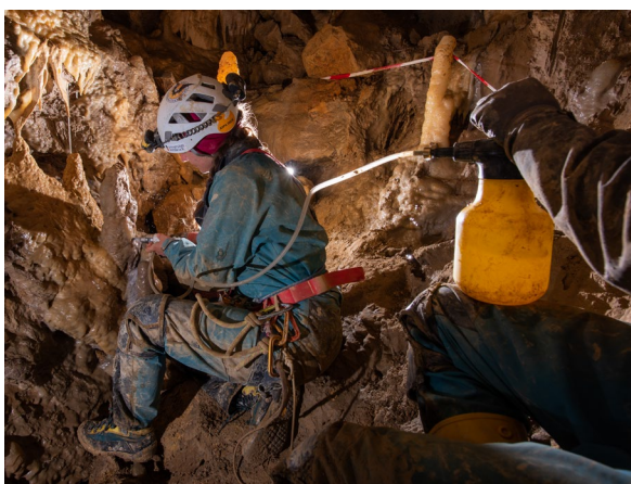
Figure 2: Sampling of a calcite core in a stalagmite with a hand-held drill and a water flushing unit.