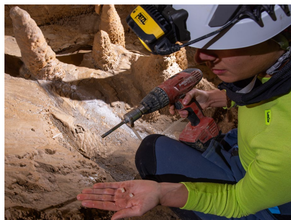
Figure 3: Example of small core pieces used for dating.

Our sampling approach of taking drill cores instead of entire dripstones minimizes the impact on the cave environment (Fig. 2) (SPÖTL and MATTEY, 2012). In order to search for LIG speleothems, we drilled small-diameter cores (Fig. 3) at the