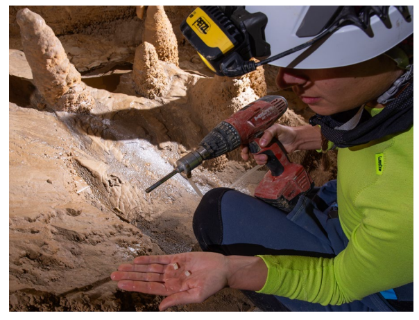
Figure 3: Example of small core pieces used for dating.

Our sampling approach of taking drill cores instead of entire dripstones minimizes the impact on the cave environment (Fig. 2) (SPÖTL and MATTEY, 2012). In order to search for LIG speleothems, we drilled small-diameter cores (Fig. 3) at the