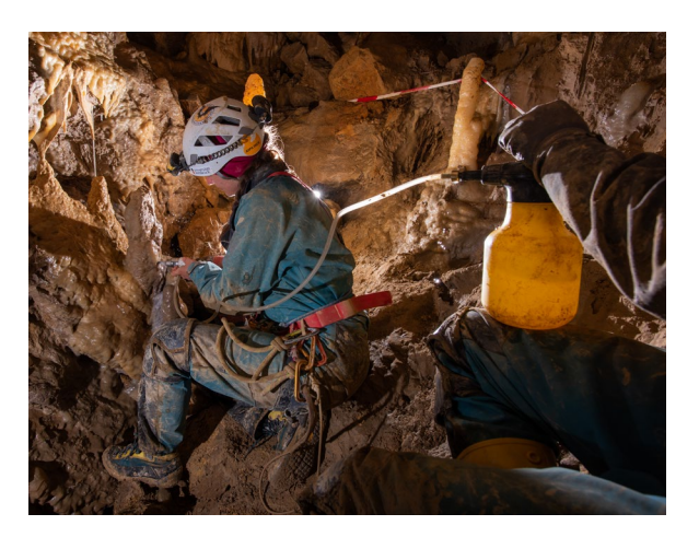
Figure 2: Sampling of a calcite core in a stalagmite with a hand-held drill and a water flushing unit.

Our sampling approach of taking drill cores instead of entire dripstones minimizes the impact on the cave environment (Fig. 2) (SPÖTL and MATTEY, 2012). In order to search for LIG speleothems, we drilled small-diameter cores (Fig. 3) at the