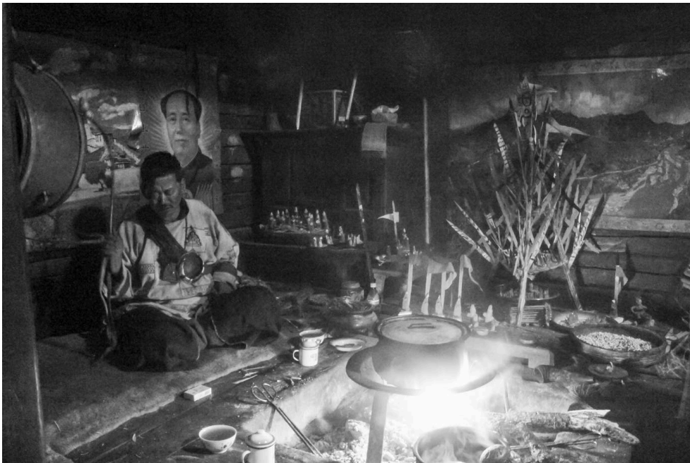
Figure 2. A daba conducting a propitiatory ritual (Lijiazui, January 2013)