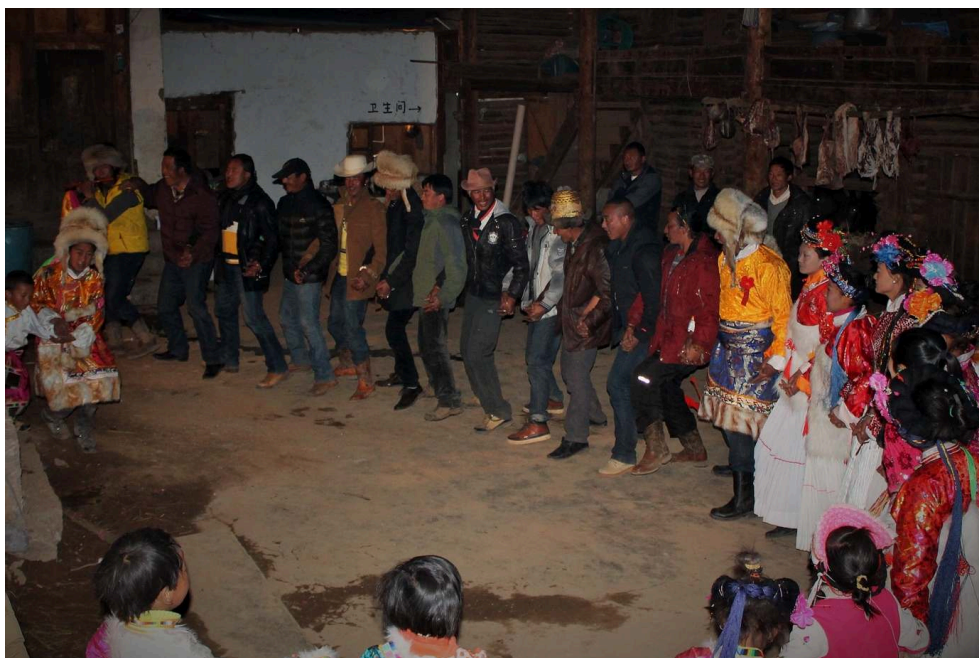
Figure 3. Dancers at a gutch festivity (a village in Yongning plain, January 2013)

The wedding couple makes the junction between men and women. The husband wears a Tibetan-style outfit, and the bride follows him in a glittering Na clothes