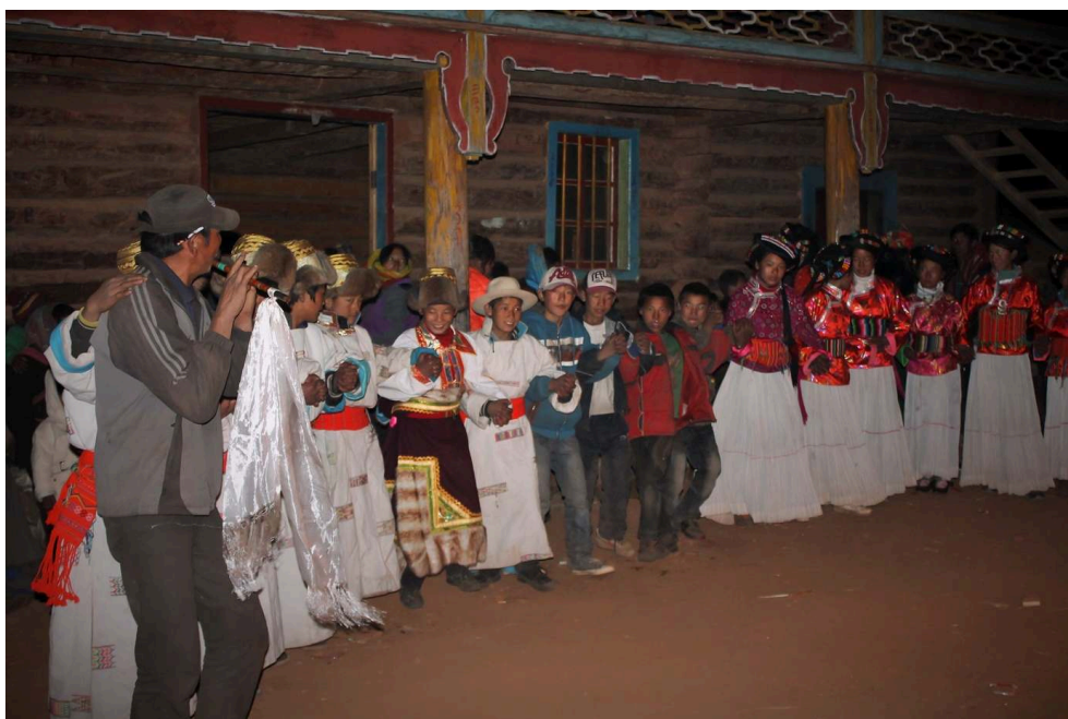
Figure 5. The younger generation is taking over (Lijazui, January 2013)