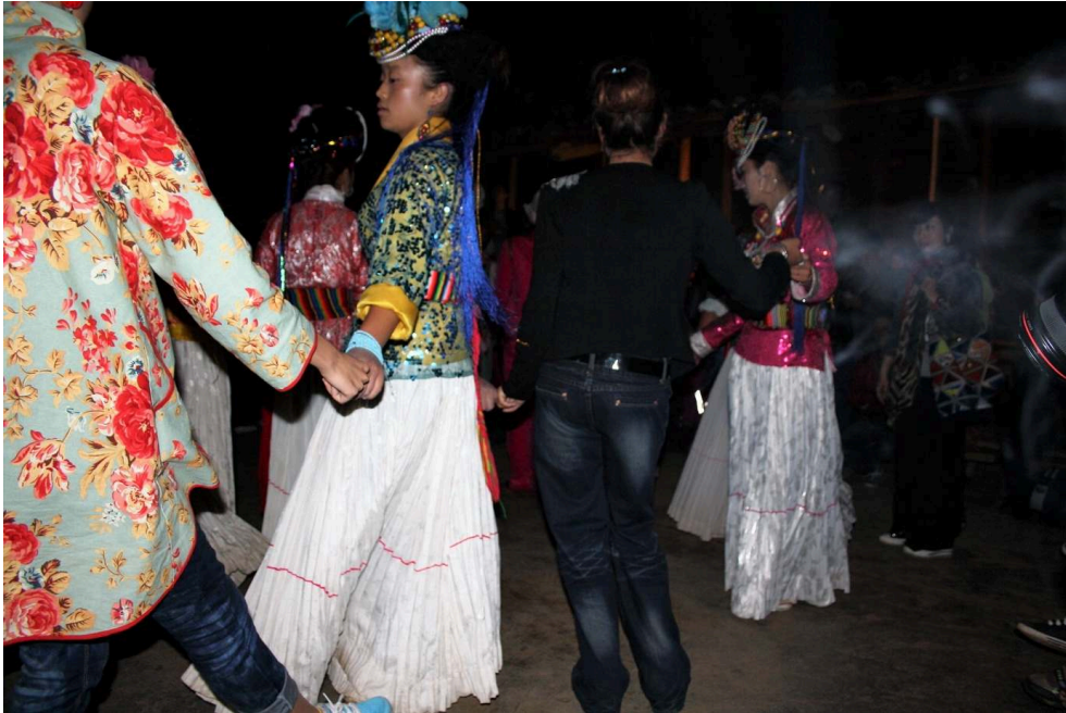
Figure 7. Messy dance circles with tourists (Xiaoluoshui, July 2009)