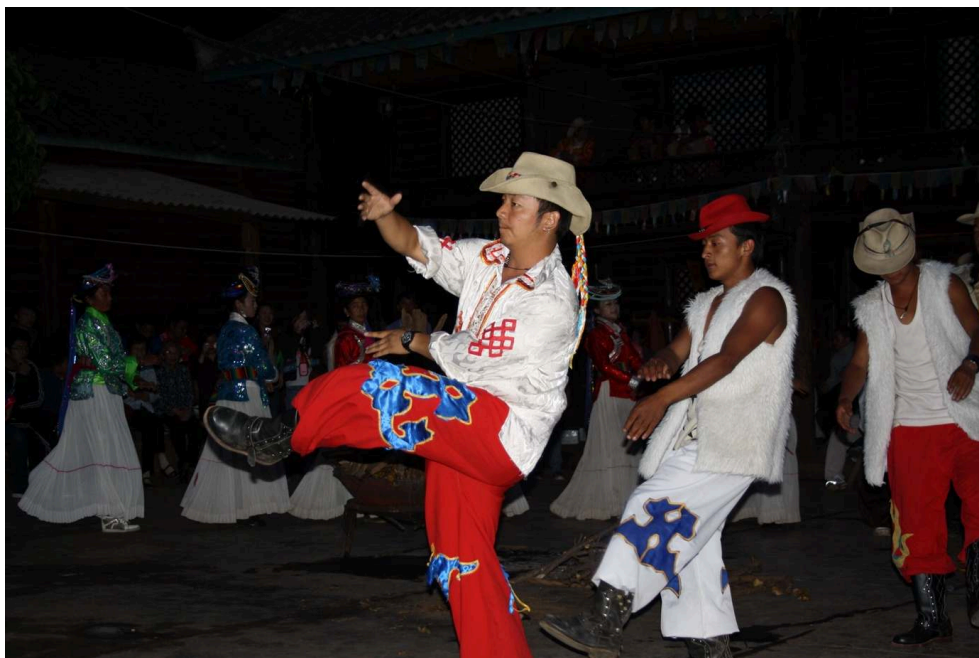
Figure 6. A final sequence of Na performance for tourists (Xiaoluoshui, July 2011)

The choreography does not exist in Lijiazui. In the background women wear very elaborate and glittering headdresses