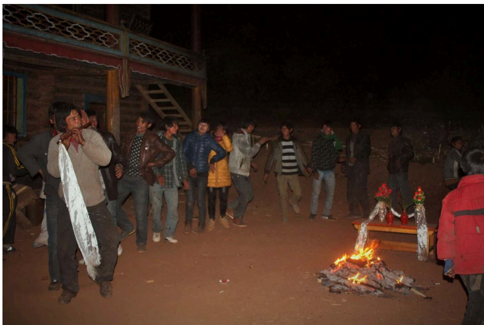
Figure 4. Zabala's altar, the divinity of the hearth standing outside the house for the event and some boys dancing more roughly at the end of the evening (Lijazui, January 2013)