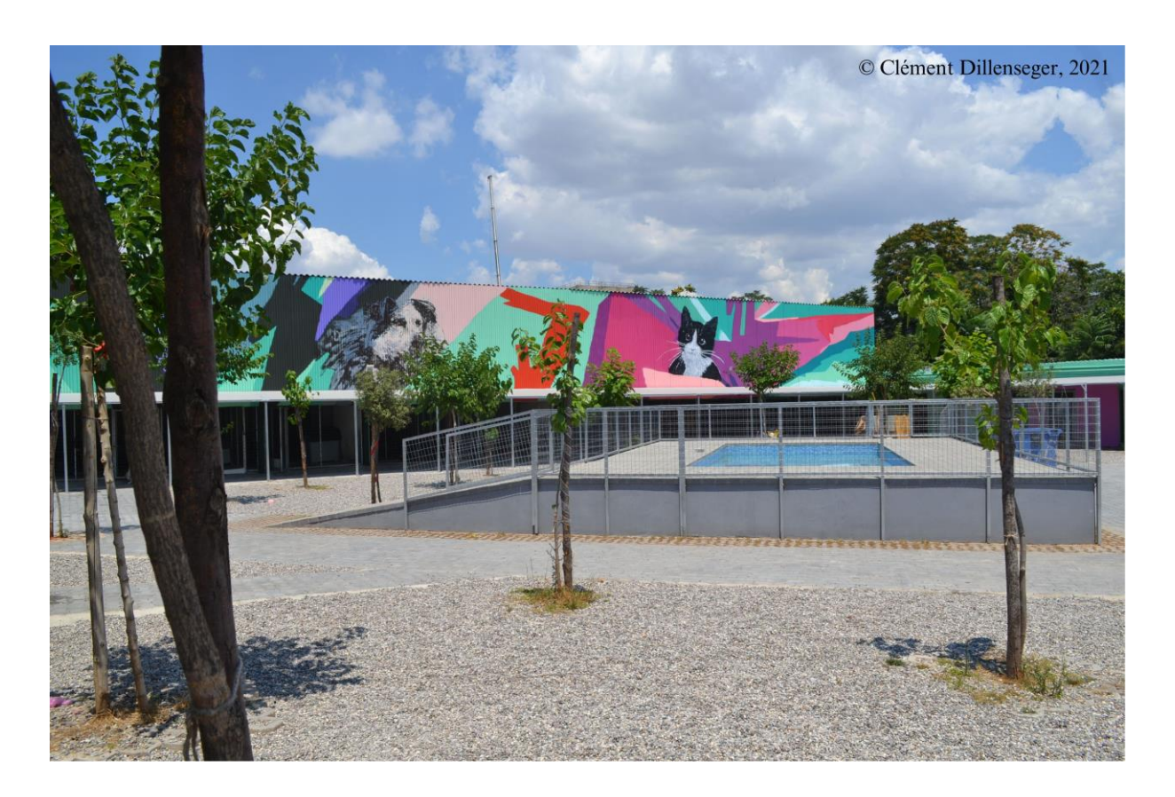
Photo 5 - Athènes between cats and dogs: the pediment of the new municipal shelter

The Urban Wildlife Service (αστική πανίδα) was created in 2004, at the time of the Olympic Games, to manage the "problem" of stray dogs. Its mission is to raise awareness of animal welfare among residents, ensure respect for animal welfare in the city and manage stray animals found in public spaces. While the offices of the municipal service are located in the hypercentre of Athens (in Psyrri), the industrial district of Eleonas/Botanikos saw the opening of a municipal shelter in 2021. On the shelter's pediment is a street art fresco depicting Socrates, a stray dog from the Plaka district, known by many Athenians and whose death was much publicized in animal rights circles and beyond. Alongside Socrates is a cat, another animal symbolic of urban life in Athens (photo 5).