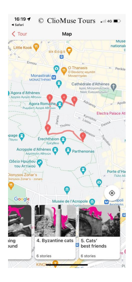
Photo 9 - Tourism of Athens' history through the presence of cats

offers to be accompanied around three times a week in her daily voluntary work. During the tour, she identifies each of the animals with a specific first name: she has identified them all and helped to catch, sterilize and microchip them thanks to registrations from tourists, who mainly come from other European countries. This visit is also a way of learning more about the presence of these cats and the way in which different actors look after them (or not).