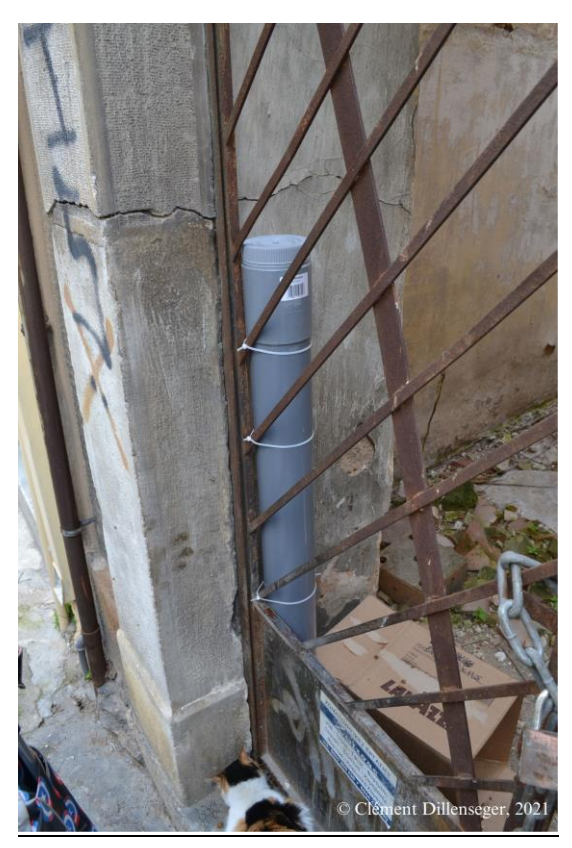
Photo 1 and 2 - Two stray cat feeders in Pagrati (1) and Thiseio (2)

In the same way, there are numerous animal huts, testifying to the peaceful cohabitation and even solidarity between cats and residents. More or less visible, these shelters for felines