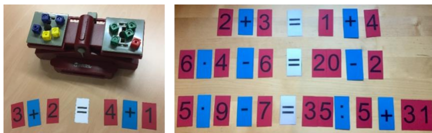
Figure 1: Material for the open-ended task IE-IES

To measure students' solutions to an open-ended arithmetic task, we developed a task that encourages students to invent and systematize equations. This task which we subsequently call "Inventing Equations and Equation Sets" (IE-IES) includes two different activities. The first activity consists of inventing various equations in which the equal sign is relationally used (IE: e.g., 2 + 7 - 3 = 10 - 4 ) (Harbour, Karp & Lingo, 2016). The second activity was about inventing a set of equations (IES: 2 + 7 - 3 = 10 - 4 , 2 + 7 - 2 = 10 - 3 , 2 + 7 - 1 = 10 - 2 ). Here, we ask students to take one already invented equation, try to vary it to get another equation that is related to the first one, and then vary the second equation, etc. The students had a set of cards with numbers from 0 to 9 and operation signs for addition, subtraction, multiplication, and division (see Figure 1).