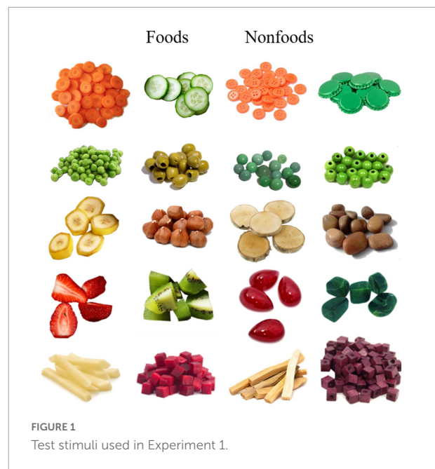
FIGURE 1 Test stimuli used in Experiment 1.

The type of response for each food stimulus (hit or miss) and each nonfood stimulus (correct rejection or false alarm) was recorded. Each participant was assigned a hit score (i.e., number of food stimuli categorized as food), a miss score (i.e., number of food stimuli categorized as nonfood), a correct rejection score (i.e., number of nonfood stimuli categorized as nonfood), and a false alarm score (i.e., number of nonfood stimuli categorized as food). Hit, miss, correct rejection, and false alarm scores could vary between 0 and 10. These scores were used to calculate a categorization performance score, the sensitivity index A' , and a categorization strategy score, the Beta, derived from SDT (57), adapting them to experiments based on small numbers of stimuli [see ref. (70)]. SDT is used to analyze data derived from tasks where a decision is made regarding the presence or absence of a signal (i.e., the foods) embedded in noise (i.e., the