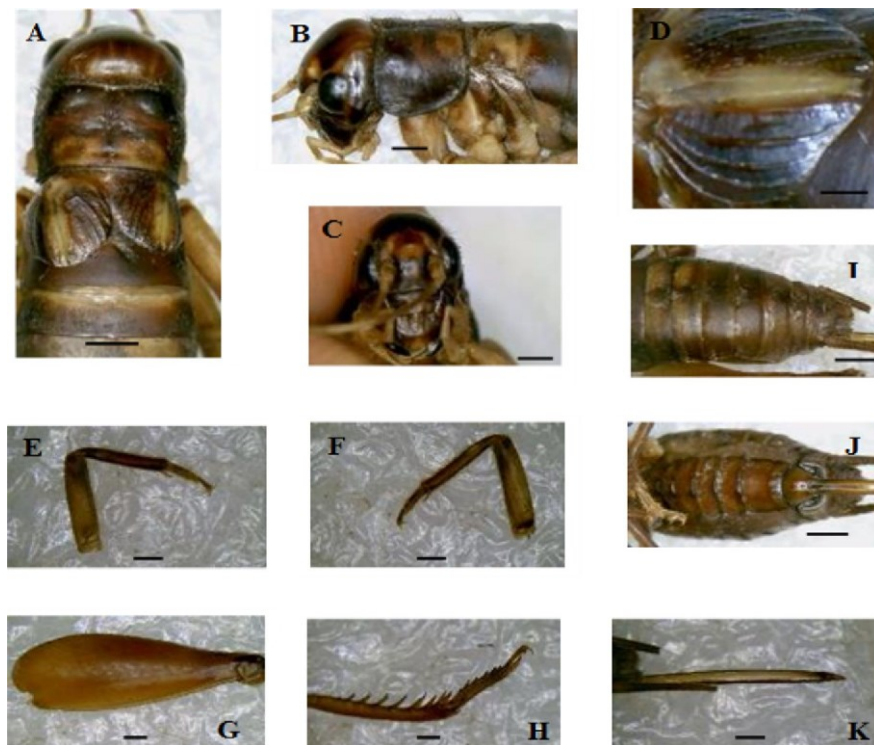
FIGURE 2. Gymnogryllus bilongi sp. nov. Paratype (female). A. Head and pronotum in dorsal view; B. Head and pronotum in lateral view; C. Head in ventral view; D. Forewing; E. Internal face of the anterior tibia with a short and round tympanum; F. External face of the anterior tibia with an oval and elongated tympanum; G. External face of orange-brown femora; H. Posterior brown tibia; I. Abdomen in dorsal view; J. Abdomen in ventral view; K. Ovipositor. Scale bars: A, 9 mm; B, C, 6 mm; D, 8 mm; E, F, K, 5 mm; G, H, 4 mm; I, J, 7 mm.

Females. They look morphologically like males although their anterior wings are micropterous with rounded ends (Figure 2). In addition, they appear larger and have a different number of subapical spurs: 4 inner and 5 outer (Table 1).