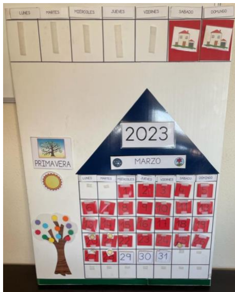
Figure 2: Calendar used in each day's routine activities

The number board is especially useful for addressing estimation and awareness of number patterns. To work on estimation, the teacher uncovers the different number families as she goes through them in depth, but asks her students where they think a hidden number will be. The number patterns are approached with activities in which she shows the panel (or a section) practically empty (Figure 4). She names the missing numbers in no particular order and the students have to indicate where the numbers are.