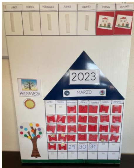
Figure 2: Calendar used in each day's routine activities

The number board is especially useful for addressing estimation and awareness of number patterns. To work on estimation, the teacher uncovers the different number families as she goes through them in depth, but asks her students where they think a hidden number will be. The number patterns are approached with activities in which she shows the panel (or a section) practically empty (Figure 4). She names the missing numbers in no particular order and the students have to indicate where the numbers are.