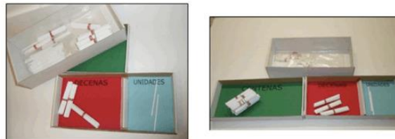
Figure 5: Number box and sticks used to set up units, tens and hundreds

To illustrate how other components are addressed, such as awareness of the relationship between number and quantity, quantity discrimination or the different representations of number, the use of the number box is essential (Figure 5). It facilitates the exploration and manipulation of numbers, favouring a correct understanding of the decimal number system. Working with the number box produces a qualitative leap in the understanding of numbers and their size, as it provides a concrete model that is faithful to the visible reality, which gives meaning to the use of written symbols and concepts related to positional value.