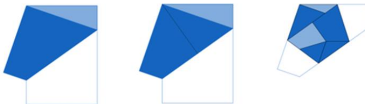
Figure 1: Main steps of the folding process

The problem is drawn from the book of Lam and Pope (2016). The starting point is the folding procedure that produces an approximate regular pentagon from an A4 sheet. The procedure consists of three main steps, see Figure 1.