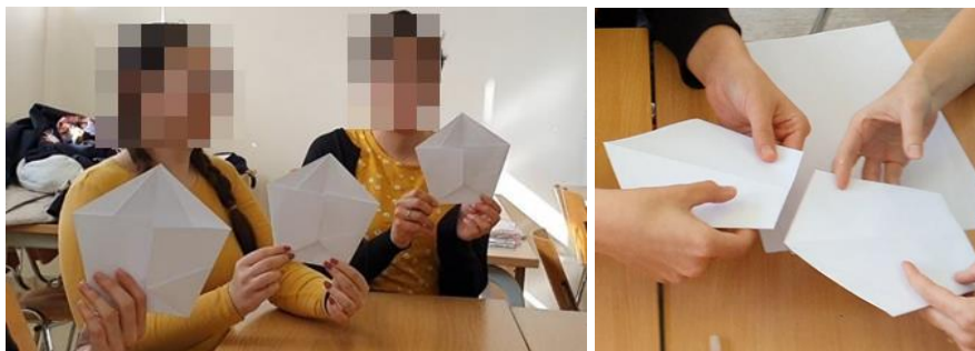
Figure 4: Recognising the shape (left) and empirical argumentation (right)

E1 starts at the end of the folding procedure when the students finish folding and globally recognise the shape as the prototype of a regular pentagon (perceptual evidence); moreover, as shown in Figure 4, after folding they hold their pentagons and directly compare the sides to check if they are equal (ostensive argument). At the end of E1, the conjecture is formulated: The shape is a regular pentagon.