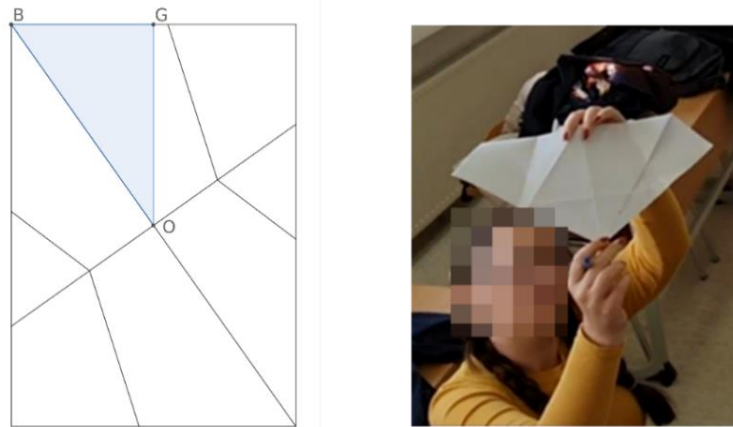
Figure 5: Right triangle to calculate angle (left) and empirical confirmation of symmetry (right)

In the last E4 episode, the looking-back phase appeared spontaneously once the angle was determined. Maybe the strength of their original conjecture makes the students doubt the correctness of the calculation. Group members reconsidered how they had come to the result and checked the calculations they had made. In addition, one of them (S3) also confirmed the conclusion by folding in half the pentagon by a line different from the previous one. "The two top sides do not fit exactly. It did not come out ..." - S3 said. This moment illustrates the dynamics between intuition and proving well again and the extension of the regular pentagon conception to a new property: a regular pentagon is symmetric to any line joining the vertex and the midpoint of the opposite side.