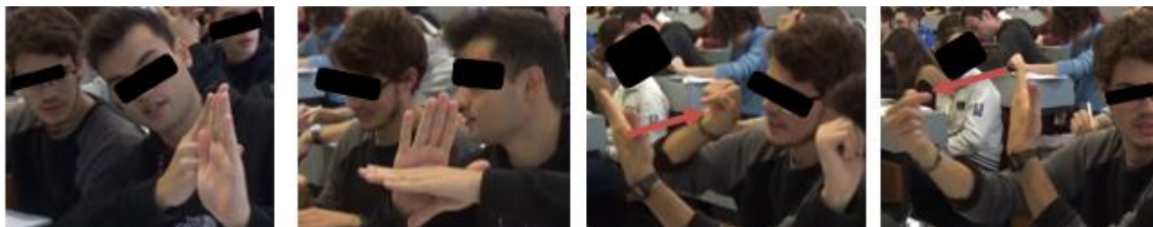
Figure 2 (a,b,c,d): key gestures performed by the students while solving the task

At the beginning, they start drawing the transformation on their notebooks. They reason a bit on the drawing but struggle to visualize the three-dimensional transformation and thus which are the vectors that keep the same direction when transformed. Then, they start representing the situation with their hands, gesturing in the air (Fig. 2a). Doing so, they immediately realize that all the vectors staying on the student on the right's hand (representing the plane of reflection), remain fixed by the transformation, that is they stay on the same direction and keep the same magnitude, meaning that they are all eigenvectors related to the eigenvalue 1. They easily visualize that this property is shared by all the vectors staying on the plane. Later they start looking for other different eigenvectors. They state that all the vectors lying in the plane perpendicular to the reflection plane (represented in Fig. 2b by the student's left hand) are eigenvectors related to -1. They do not seem very sure about it, and explore various similar configurations by moving their hands. At one point, one of the students (Fig. 2 c and d) begins representing the vectors with his right index finger and, by moving it in different directions, realizes that all and only the vectors lying on the line passing through the origin and perpendicular to the reflection plane (represented by his left hand) are eigenvectors related to -1.