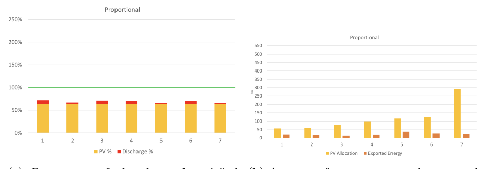
Fig. 1: Results obtained by solving (EPP-L)

(a) Percentage of the demand satisfied (b) Amount of energy exported compared with the allocated PV energy and the bat- to amount of allocated PV. tery.