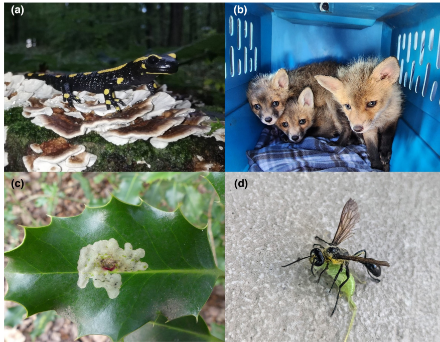
FIGURE 1 Examples of secondary data captured in images vouchering for species occurrences. (a) background habitat of a fire salamander ( Salamandra salamandra), and the unintended record of another species (the fungus) (b) the interaction between human and red fox ( Vulpes vulpes), (c) interaction between a leaf miner and the host plant, (d) predation by the Mexican grass-carrying wasp Isodontia mexicana.

datasets and their analyses. An important element in utilising secondary data is the explorative character of this research method, as the nature of this unintentionally recorded information may be unclear. The additional information may document biotic interactions and co-occurrences, which could provide not only important ecological information of the observed species but also records of the by-catch for respective monitoring programmes. Secondary data may also include details on morphology, behaviour, habitat and various other aspects of a species' traits and ecology.