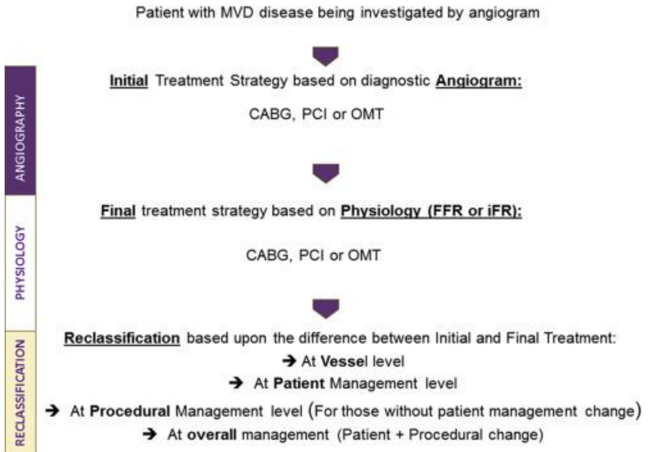
Figure 1. Representation of Study Protocol

were available for selection in an electronic Case Report Form: optimal medical therapy (OMT) alone, percutaneous coronary intervention (PCI), and coronary artery bypass grafting (Figure 1). Physicians recorded as well which vessel required either OMT, PCI, or coronary artery bypass grafting.